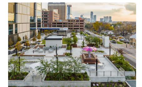
MOST INFLUENTIAL PROJECT Travis County Civil and Family Court Facility