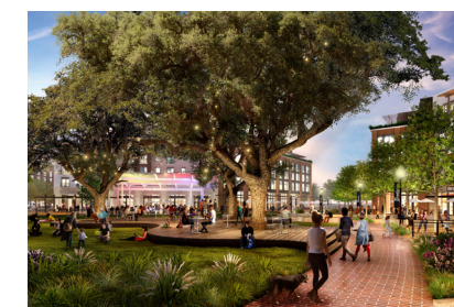
NEXT BIG IDEA Brodie Oaks Redevelopment