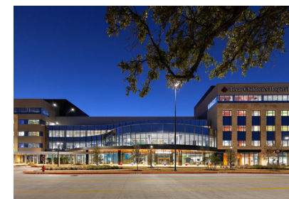
BEST PROJECT DESIGN Texas Children's Hospital North Campus