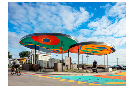
BEST PROJECT INNOVATION Community First! Pavilion