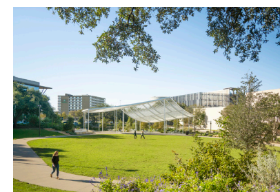
BEST PUBLIC PLACE St. John Encampment Commons