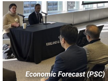
Economic Forecast (PSC)