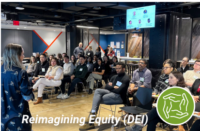
Reimagining Equity (DEI)