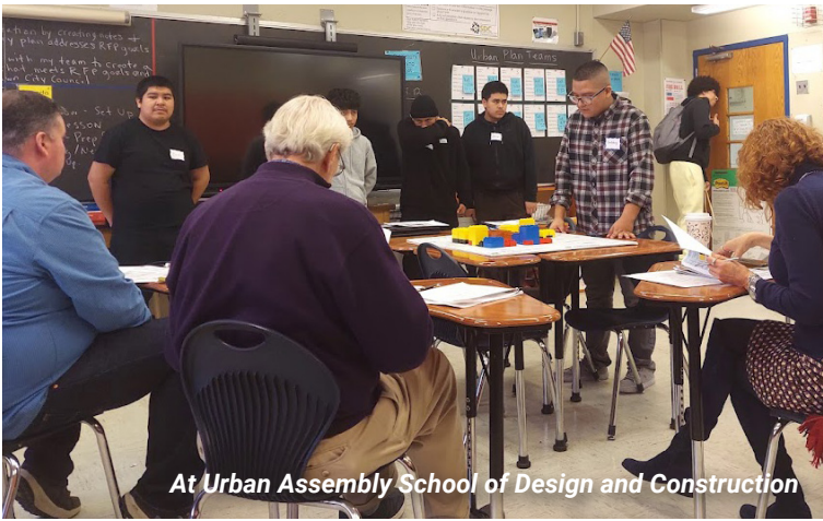
At Urban Assembly School of Design and Construction