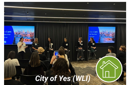
City of Yes (WLI)