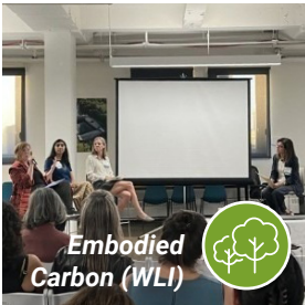
Embodied Carbon (WLI)