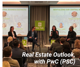
Real Estate Outlook, with PwC (PSC)