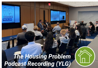
The Housing Problem Podcast Recording (YLG)