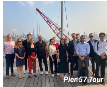
Pier 57 Tour