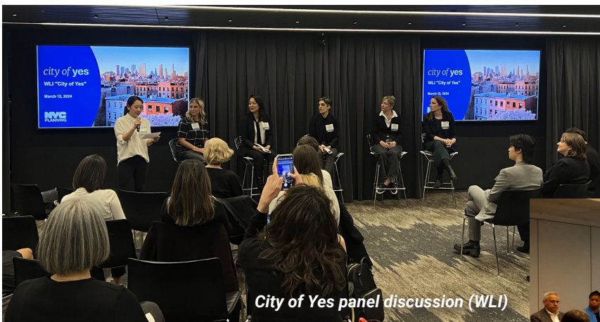
City of Yes panel discussion (WLI)

Among many other sustainability-focused events were the PSC's Financing Decarbonization and Carbon Sweet Spot panel discussions, as well as the Penn District Tour and the Infrastructure Product Council's talk on offshore wind.