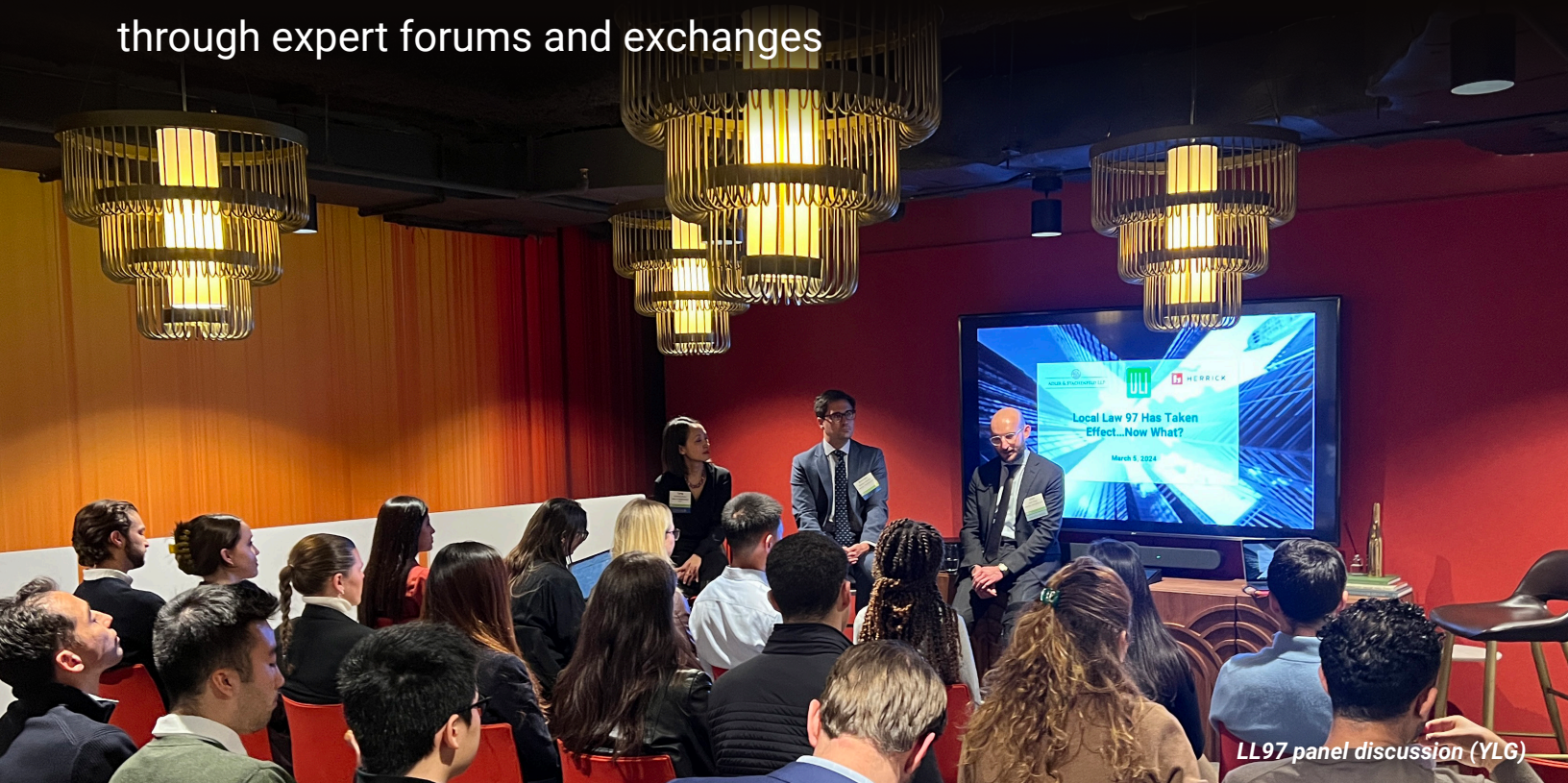
LL97 panel discussion (YLG)