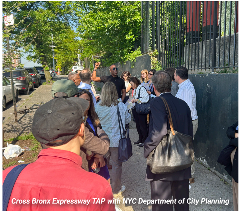
Cross Bronx Expressway TAP with NYC Department of City Planning

In May, ULI NY assembled a 10-person panel to explore strategies for the future of the Cross Bronx Expressway, focusing specifically on the impacts of climate change along a portion of the Expressway.