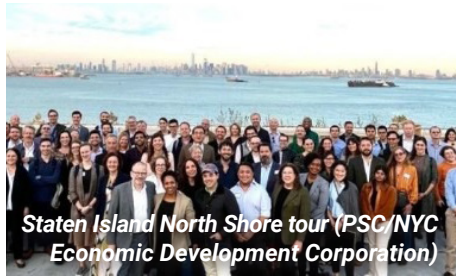
Staten Island North Shore tour