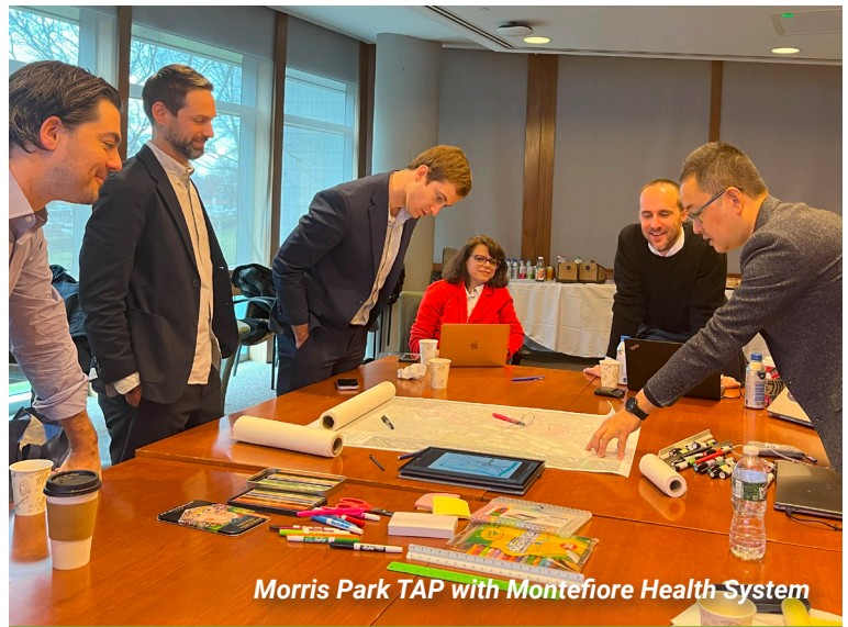
Morris Park TAP with Montefiore Health System

Our UrbanPlan program and Technical Assistance Panels (TAPs) form the backbone of our community work. UrbanPlan provides pro bono instruction for students, agencies, and community boards through simulated urban-planning workshops. Our TAPs deliver expert guidance to city agencies, nonprofits, and organizations prior to complex rezoning and urban revitalization projects.