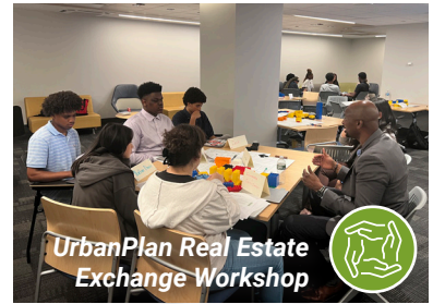
UrbanPlan Real Estate Exchange Workshop