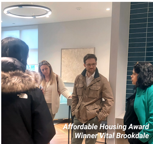
Affordable Housing Award Winner Vital Brookdale