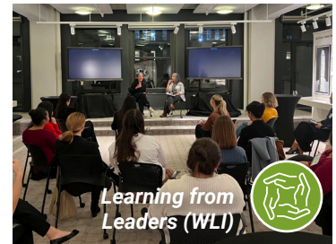
Learning from Leaders (WLI)