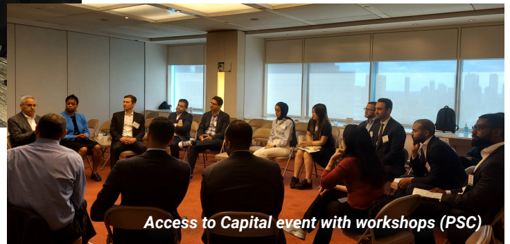
Access to Capital event with workshops (PSC)

Our events updated members about new legislation that will profoundly affect members' work. The events included a discussion on the implications of pending housing City of Yes legislation (WLI); the YLG's Sendero Verde tour; and participation in the The Housing Problem podcast's recording cohosted by affordable housing leaders Kirk Goodrich and Rafael Cestero.