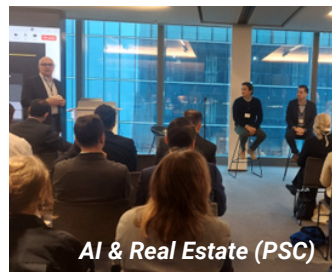
AI & Real Estate (PSC)