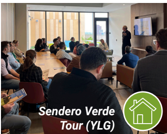
Sendero Verde Tour (YLG)