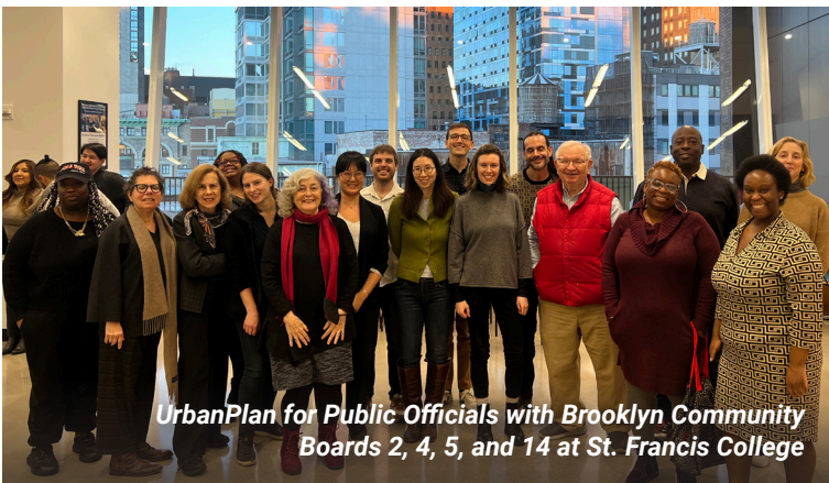
UrbanPlan for Public Officials with Brooklyn Community Boards 2, 4, 5, and 14 at St. Francis College