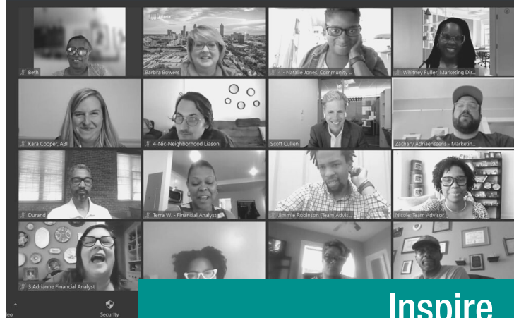
UrbanPlan for Community Leaders with Atlanta BeltLine