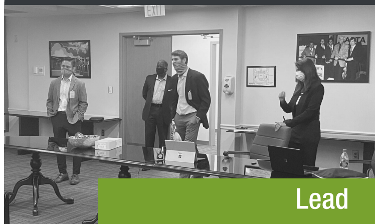
Technical Assistance with MARTA