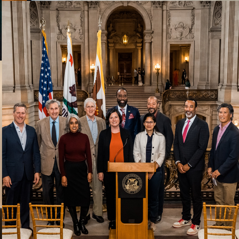
Panelists from around the country, participate in an ASP focused on downtown revitalization for San Francisco