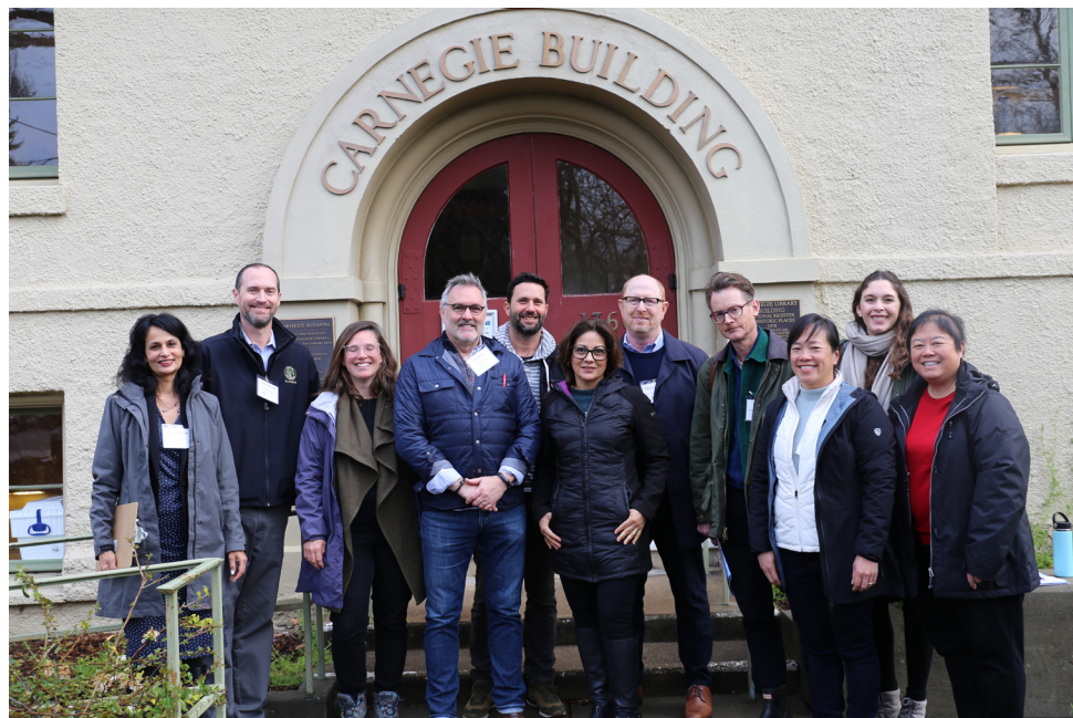
Panelists in St Helena during the two-day TAP