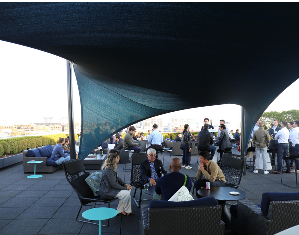
Mentor groups meet for the first time at the kickoff