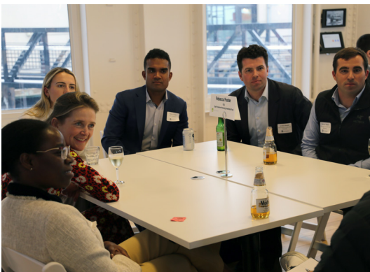
Attendees enjoying intimate, candid conversations with industry leaders in a speed-dating style setting.