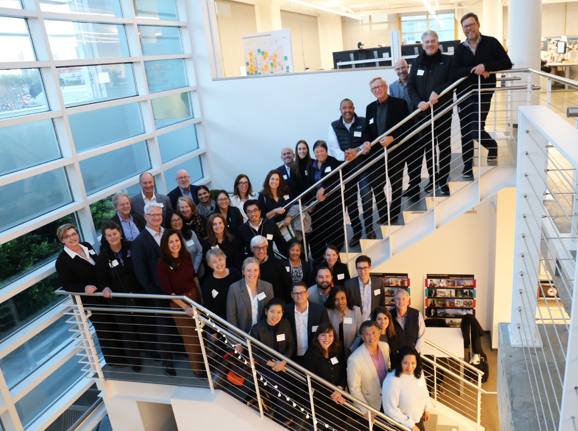
ULI SF Executive + Emeritus Board Meeting, January 2023