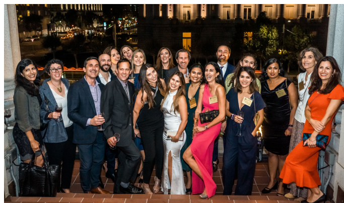
Attendees enjoying our 2022 Gala at The Green Room in San Francisco

In September 2023, ULI SF hosted its first ever Gala, which provided a time and place to celebrate our community and everything and everyone that makes ULI San Francisco so special and meaningful. We were thrilled to celebrate being back in person to Reconnect and Renew our collective commitment to ULI San Francisco's vision and values. We further exemplified our values by committing 25% of net proceeds to ULI SF's DEI initiatives, hiring four small women owned BIPOC businesses to cater the Gala, bringing in young musicians from the San Francisco Conservancy of Music to entertain, and hired a Bolivian painter to capture the evening.