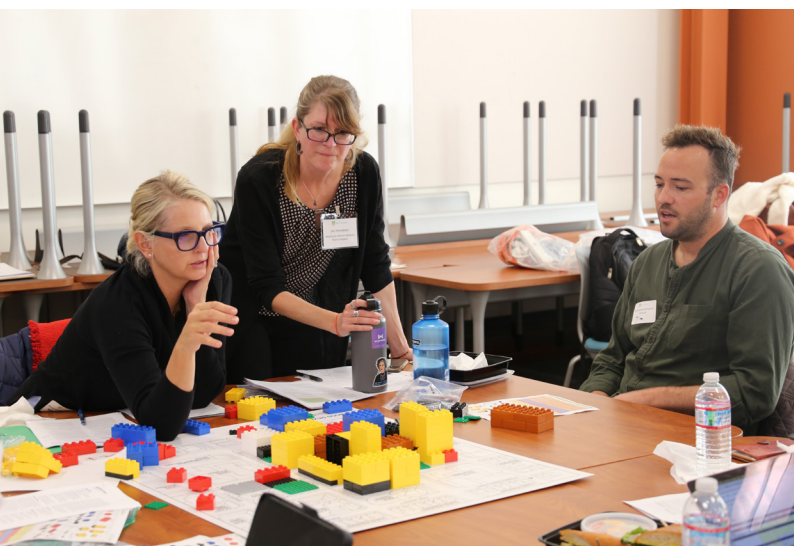
Leadership Sunnyvale participating in their fourth UrbanPlan for Communities workshop