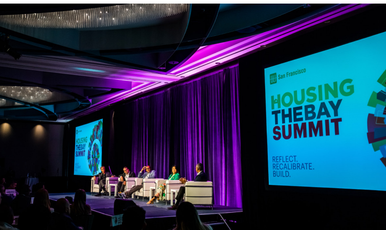
Housing the Bay Summit, 2023