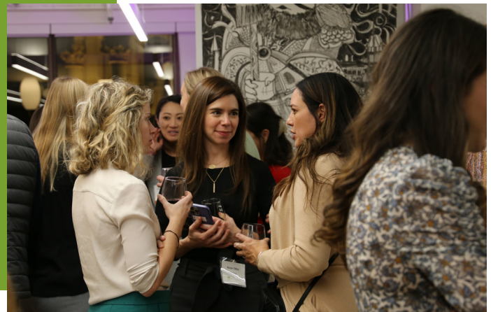
Attendees enjoying our WLI New Year Social, many of whom participate in WLI Connects