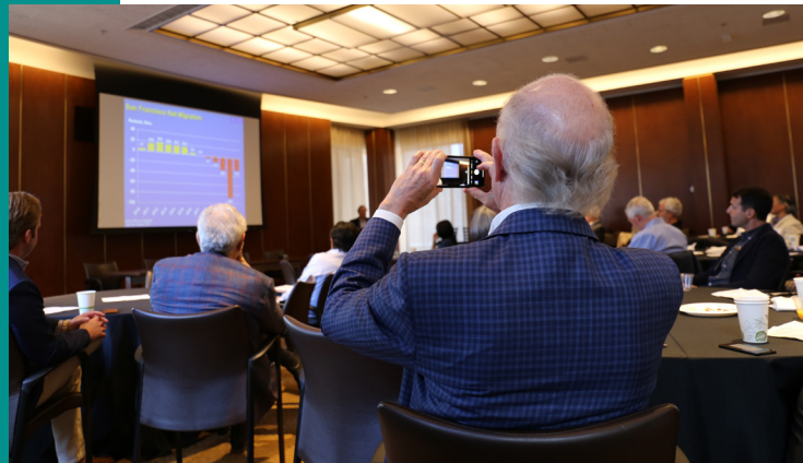
State of the Market presentation at our Spring LPC Meeting

LPC MEMBERS (56 RESIDENTIAL, 51 COMMERCIAL, 30 INNOVATION)