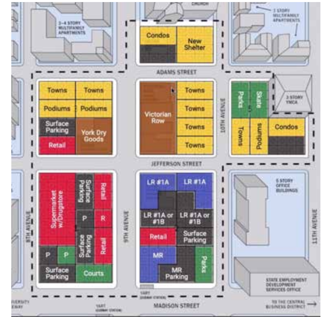
UrbanPlan Site Plan

Through UrbanPlan in high school and universities, students discover how the forces of our market economy clash and collaborate with the nonmarket forces of our representative democracy to create the built environment. UrbanPlan entered the new school year strong, using lessons learned from the previous semester to continuing to deliver value to students, teachers, and volunteers, and schools in a virtual format.