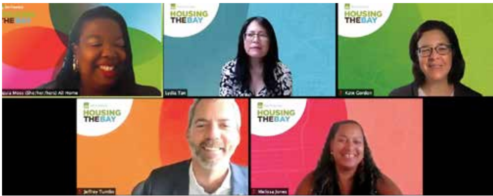
Housing the Bay Summit 2020 session: The Big Picture - A Systems Approach for Transformative Solutions