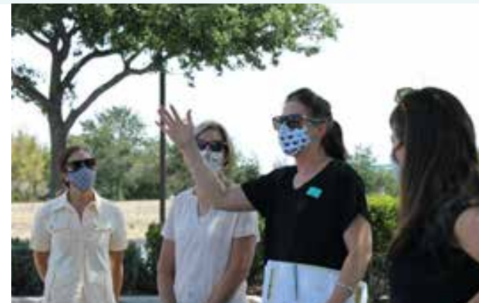
Dublin TAP site tour