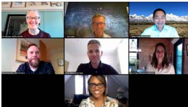
Petaluma TAP panelists