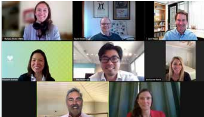
Dublin TAP panelists

This year ULI SF completed two virtual TAPs – for the City of Petaluma and the City of Dublin. Panelists on these TAPs provided insights on complex land use and real estate questions, ranging from site-specific recommendations to broad policy and land use potential.