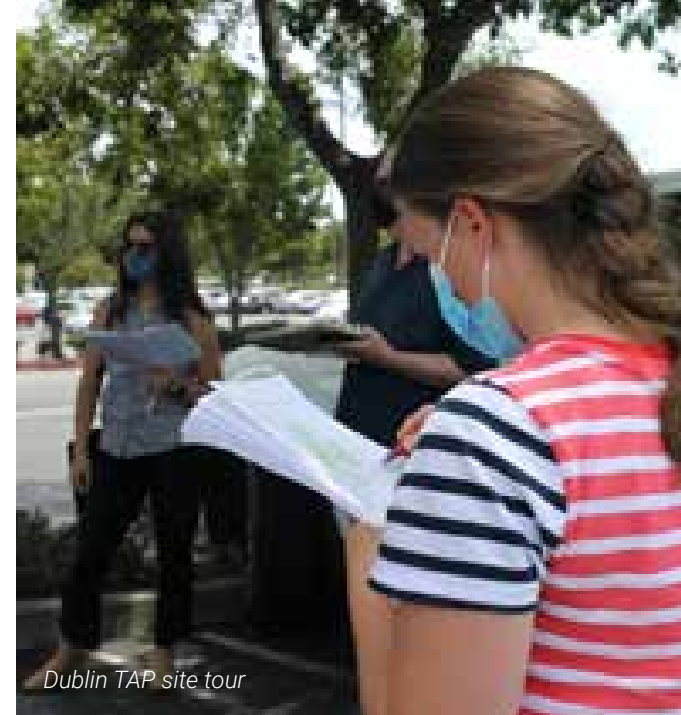
Dublin TAP site tour