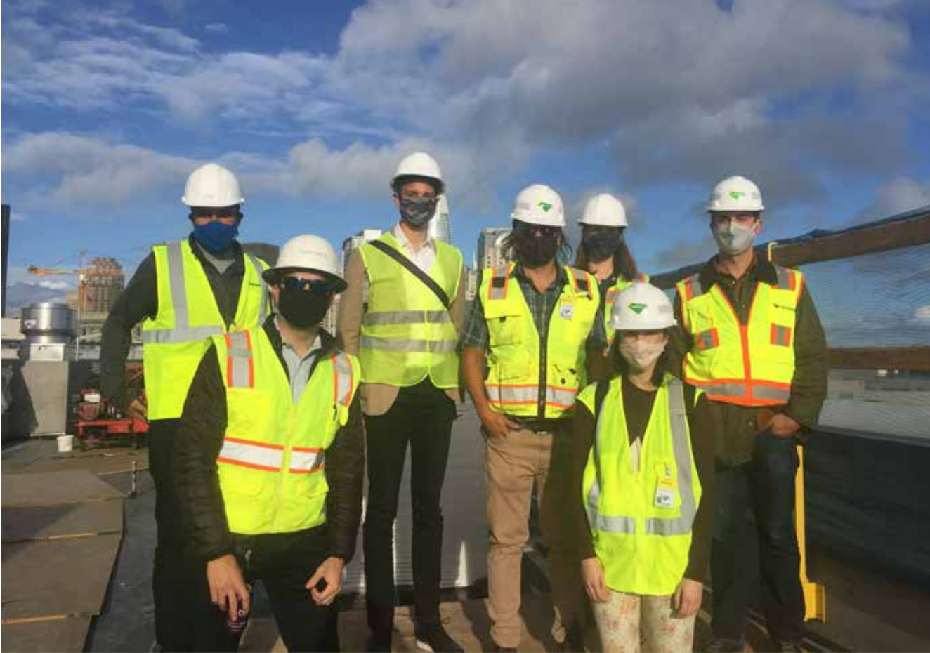
Young Leader mentor group site tour