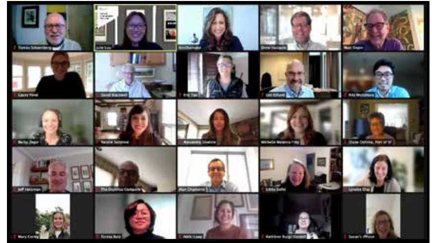
ULI San Francisco Executive Board meeting