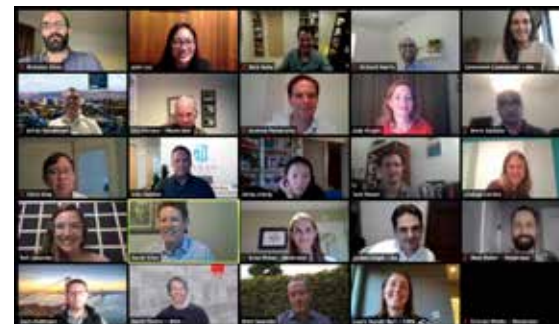
Networking event: NEXT Learn from Your Peers

their leadership skills and form relationships amongst peers and throughout the broader ULI network of Bay Area real estate and land use professionals. Signature programs include our NEXT Cohort Program, which consists of smaller, intimate groups of peers who meet throughout the year for site visits, tours, and discussions, and the Learn From Your Peers roundtable networking event.