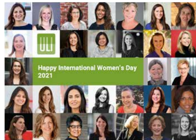
Female member leaders at ULI San Francisco

WLI engagement in the virtual world remained strong thanks to a curated mix of programming that gathered men and women in both small and large group settings for networking, career development, and even an online workout class!