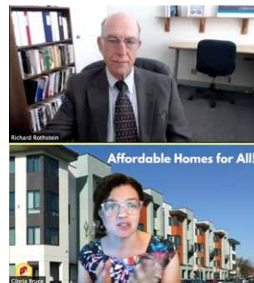
Webinar: In Conversation with Richard Rothstein

real estate trends and issues in the Bay Area, and build relationships with other industry professionals. This year's programs covered a wide variety of topics, including: building electrification; a conversation with Richard Rothstein, author of The Color of Law ; tech and off-site solutions to rising construction costs; the new regional geography of jobs and housing; and more.