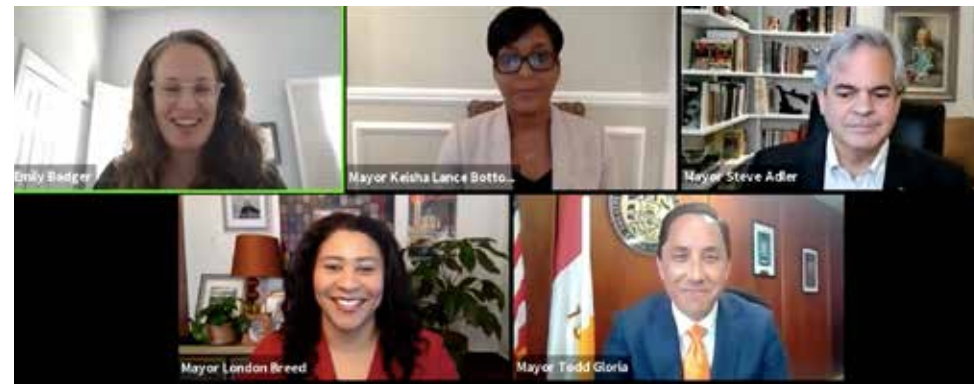
Housing the Bay Summit 2021 session: Housing Leadership Forum with US Mayors

This fiscal year we had not one but two , virtual Housing the Bay Summits, happening in September 2020 and June 2021. Our 2020 Summit explored the intersection of health, infrastructure, transportation, economics, labor, and natural systems and how we can work with and influence these systems to create positive disruption to tackle the housing crisis.