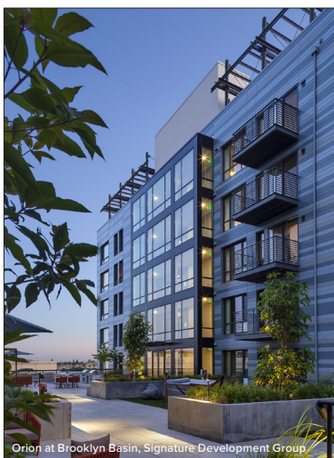
Orion at Brooklyn Basin, Signature Development Group

For our members, for our industry, for our communities.