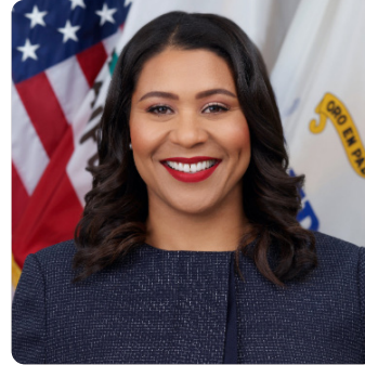
Mayor London Breed City of San Francisco