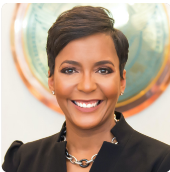
Mayor, Keisha Lance Bottoms City of Atlanta