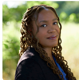
Heather McGhee Author, The Sum of Us: What Racism Costs Everyone and How We Can Prosper Together