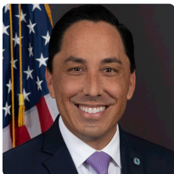
Mayor Todd Gloria City of San Diego

On December 10, 2020, Todd Gloria was sworn in as the 37th Mayor of the City of San Diego – America's eighth largest city. He is the first person-of-color and the first LGBTQ person to ever be elected the city's Mayor. A third-generation San Diegan of Filipino, Dutch, Puerto Rican, and Native American descent, Mayor Gloria's lifelong career in public service was inspired by a lesson his parents – a hotel maid and a gardener – taught him at a young age: if you care about something, then you should leave it better than you found it. That lesson continues to motivate Mayor Gloria to improve San Diego every single day.