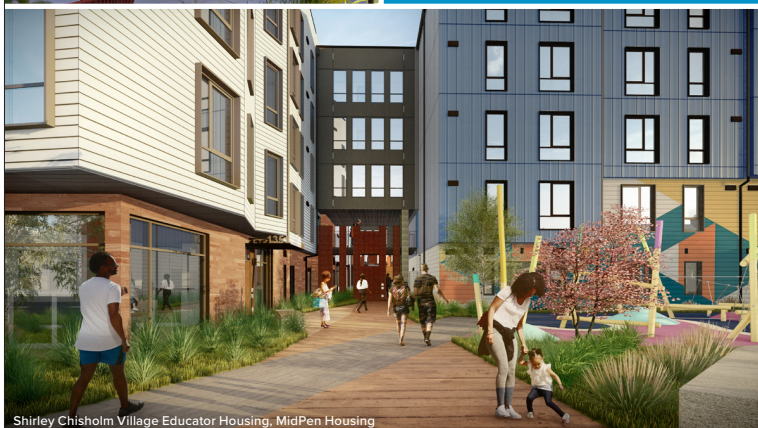
Shirley Chisholm Village Educator Housing, MidPen Housing

BAR architects SAN FRANCISCO | LOS ANGELES bararch.com