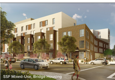
SSF Mixed-Use, Bridge Housing

BAR architects SAN FRANCISCO | LOS ANGELES bararch.com