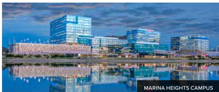
MARINA HEIGHTS CAMPUS

DEVELOPMENT ARCHITECTURE + ENGINEERING CONSTRUCTION REAL ESTATE MANAGEMENT CAPITAL MARKETS