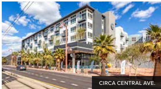
CIRCA CENTRAL AVE.