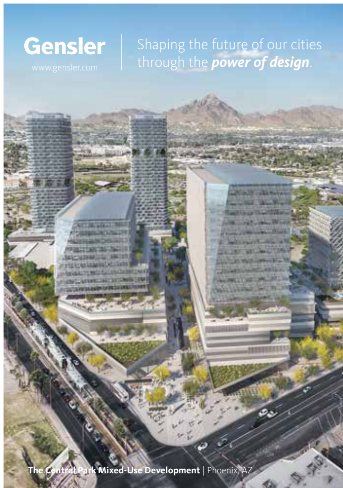
The Central Park Mixed-Use Development | Phoenix, AZ

Shaping the future of our cities through the power of design.