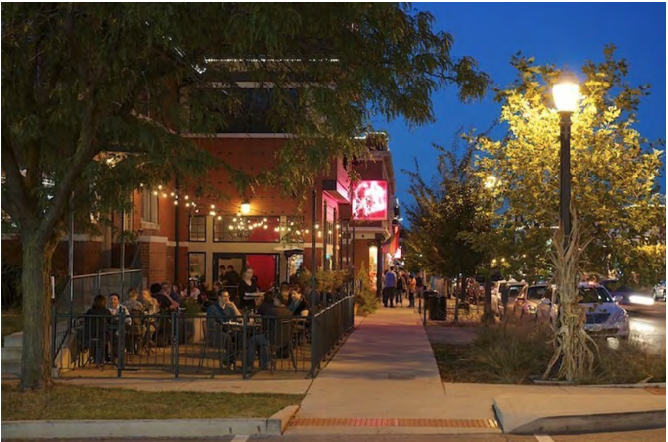
SOUTH GRAND CID