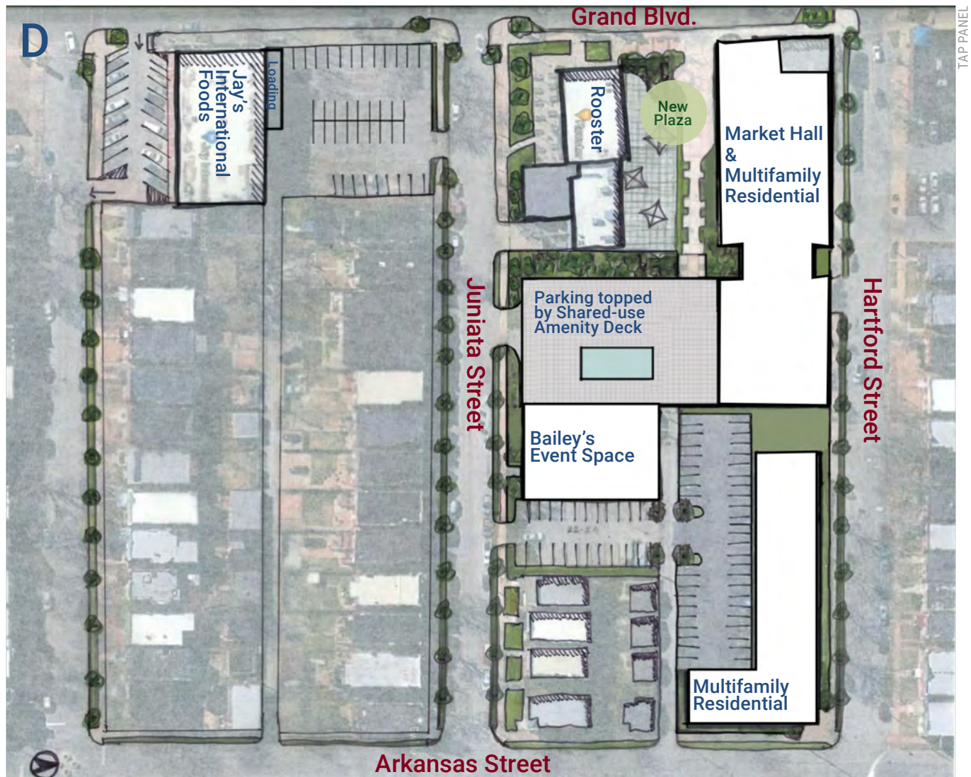
Option D represents a possible hotel configuration for the neighborhood, placed with Market Hall at the corner of Grand and Hartford.

The CID lot again becomes residential, perhaps using the townhome liner design noted earlier.