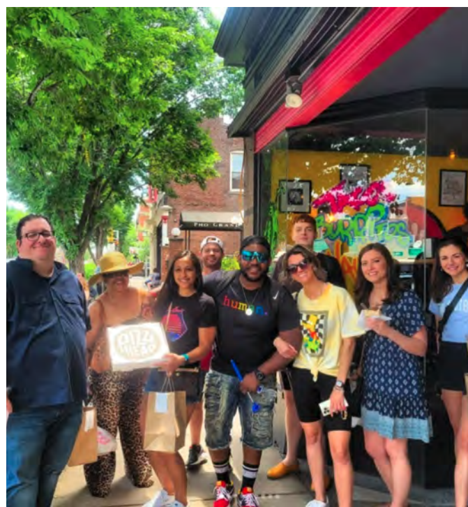
SOUTH GRAND CID

South Grand has developed a host of programs and annual festivals that bring life, activation, and consumers to the district.