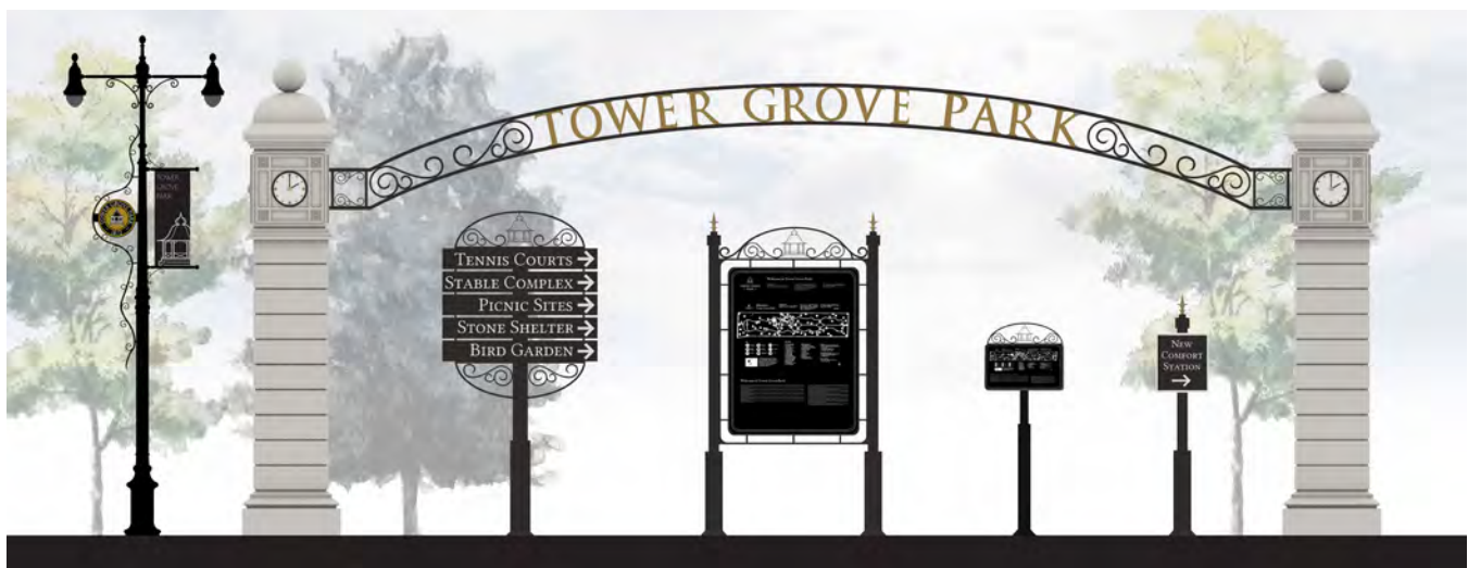
This wayfinding signage, developed during a CityStudioSTL engagement, is a good example of how design cues, deployed across a variety of formats, can signal important directional information to visitors.

Wayfinding, Branding, and Identity. South Grand is truly unique and those “in the know,” i.e. business owners contributing to the CID, know where the district begins and ends. For the general public, however, it is not clear where the CID boundaries lie. The entirety of South Grand Boulevard runs over nine miles long. The section within the CID has a special identity that should be called out, branded, and celebrated. Adding an entrance sign of some sort at Grand's intersection with Arsenal would create a sense of arrival and help reduce traffic speed. The CID could enlist the community in the effort by creating a design competition or engagement experience to help shape the look and feel of such a sign. That same look and fee/branding could also be spread further