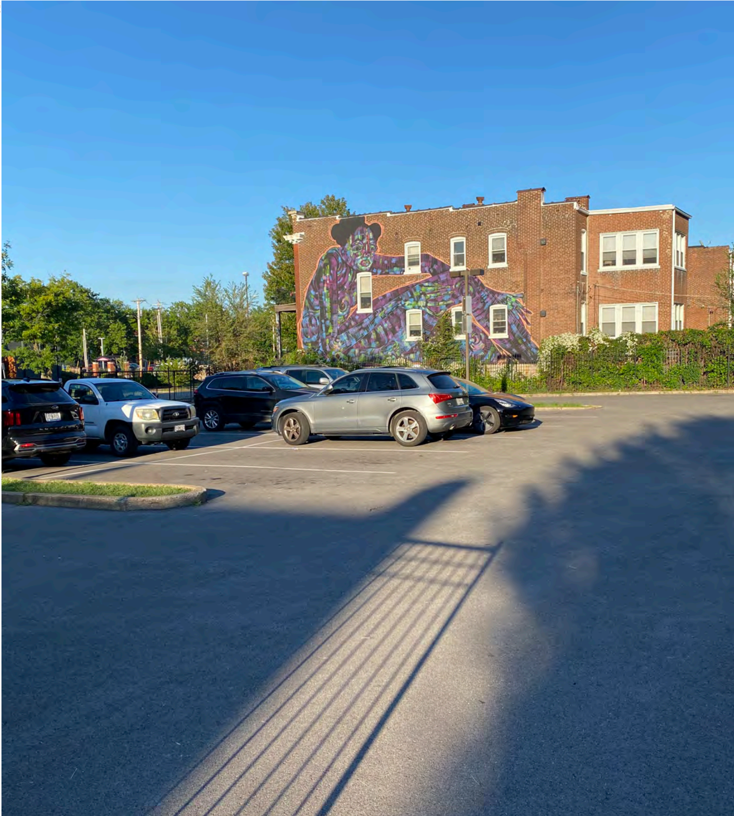
A parking lot along the north side of Jay's International Foods sits on the east side of Grand Boulevard.