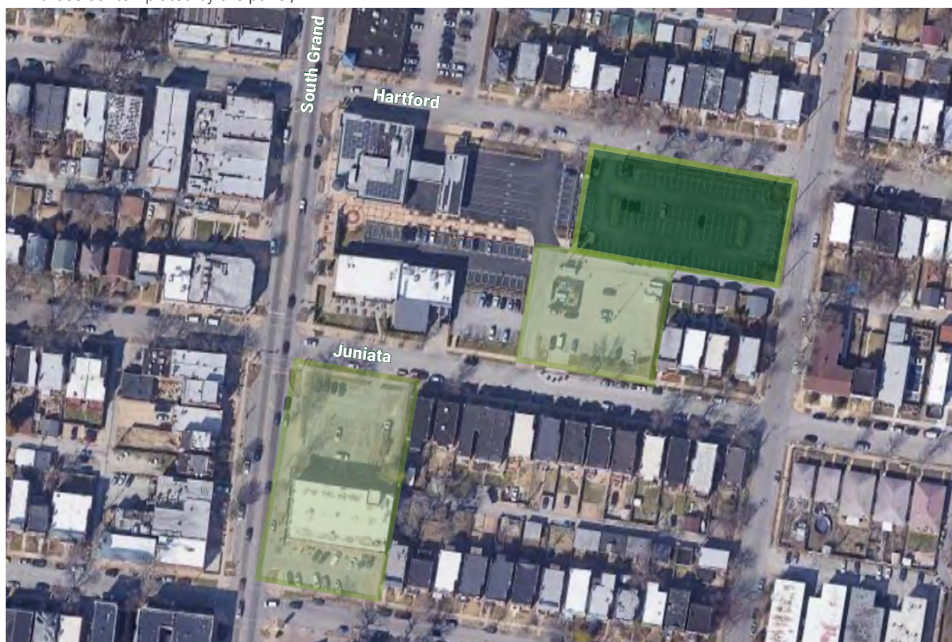
The South Grand CID public parking lot is highlighted in dark green. Directly south and highlighted in light green is the parking lot owned by Bailey's Restaurants, and the land and building owned by Jay's International Foods is at the southeast corner of Juniata and Grand and is also highlighted in light green.