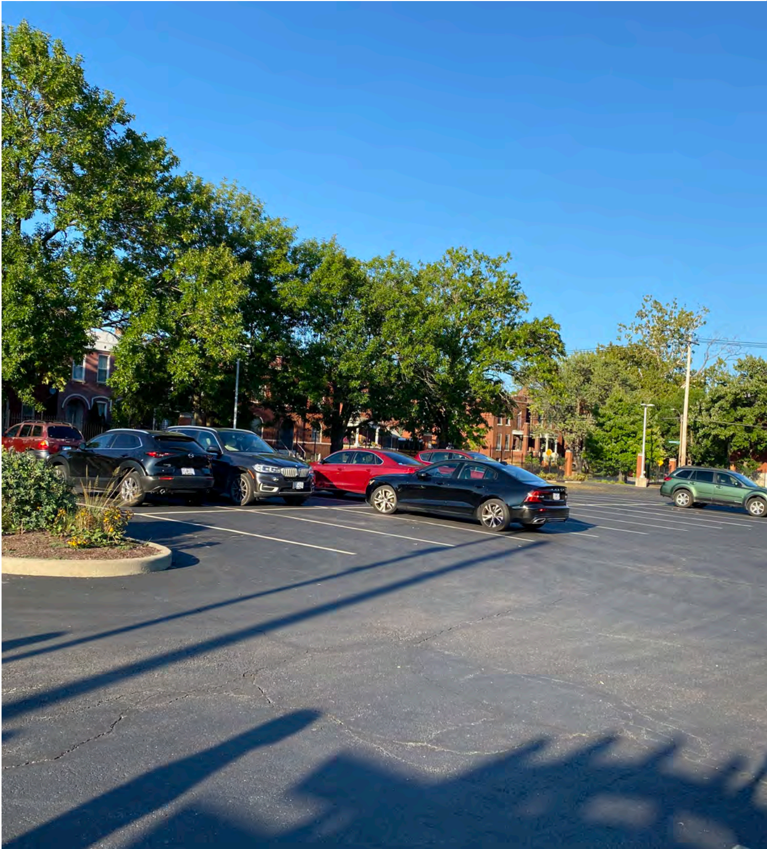
The South Grand Community Improvement District (CID) parking lot, owned and maintained by the CID, sits just east off Grand Boulevard and could be redeveloped into a new use.