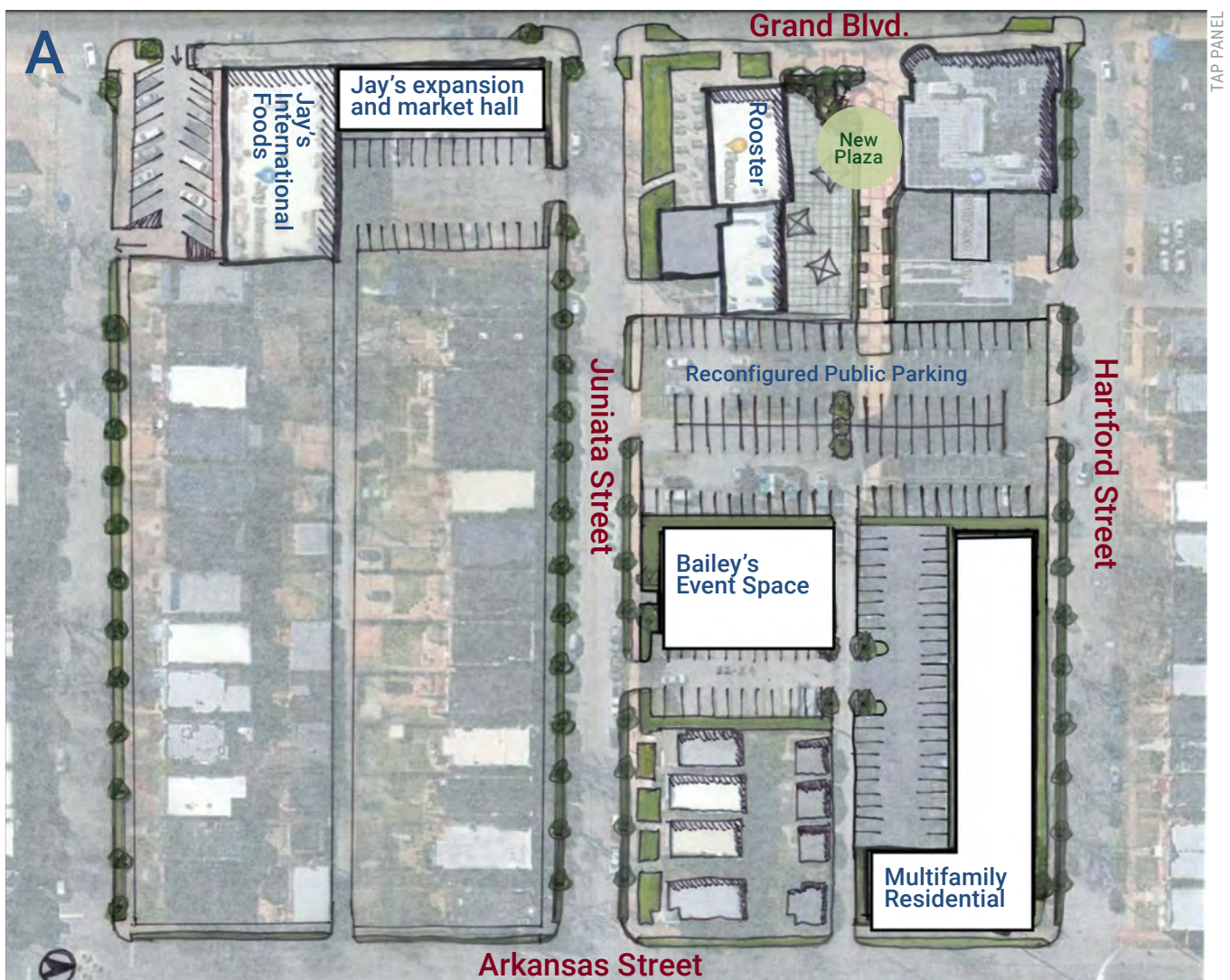
Option A involves an expansion of the existing environment with the CID lot sold to a multifamily developer.

In this scenario, the current CID parking lot is sold to a developer in pursuit of multifamily housing on the parcel. The addition of multifamily options in the neighborhood provides new-construction housing opportunities in the neighborhood and delivers it in a property type that is currently missing in the area. New multifamily units would also provide aging neighbors with a viable residential alternative to the neighborhood's predominant multi-story single-family homes. The panel recommends a building configuration that lines Hartford with townhome structures that have an attached apartment building behind. Further