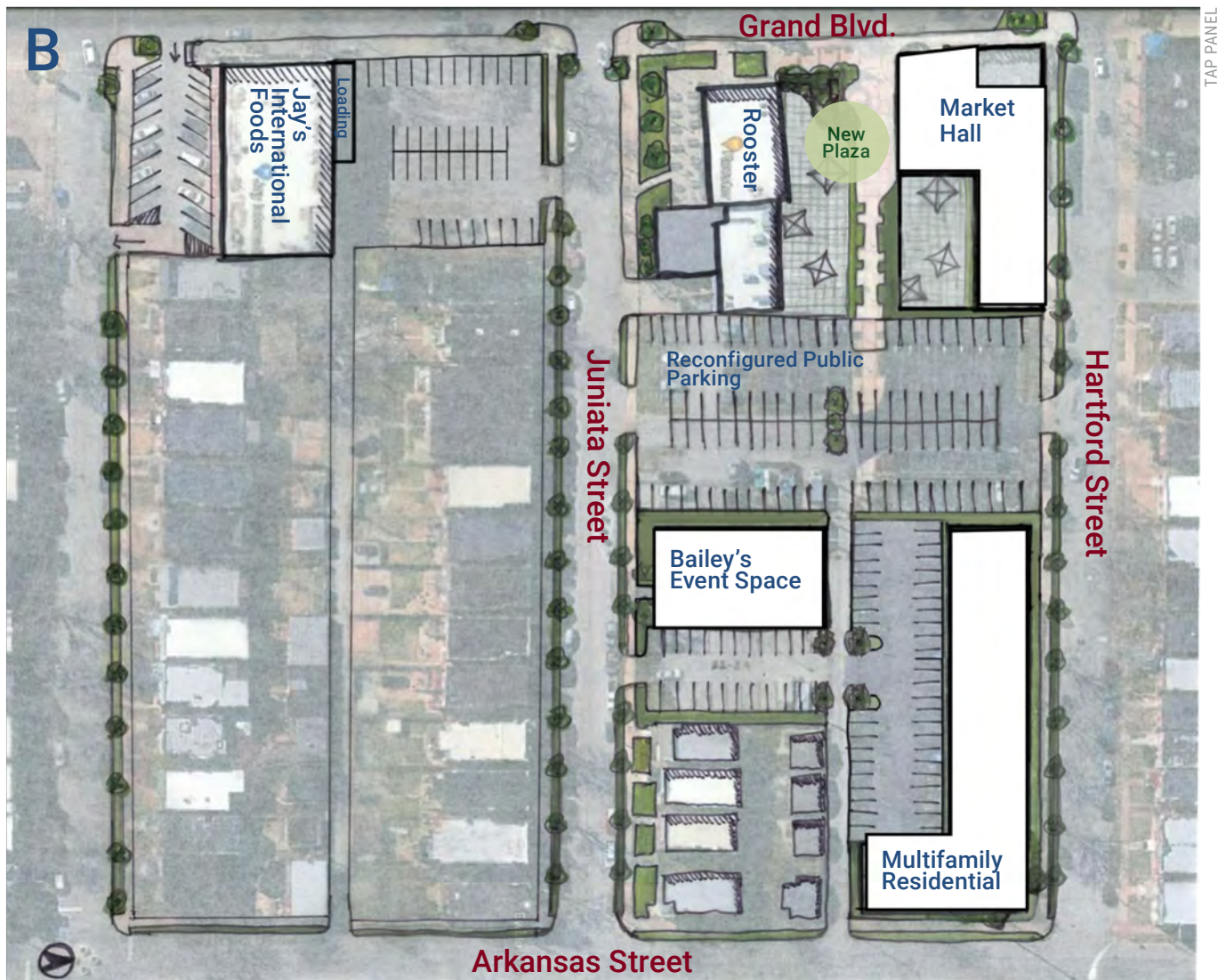
Option B envisions the Market Hall concept at the current Commerce Bank site.