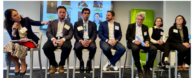
Unstacking the Capital Stack - Creative Capital Event, March 2026