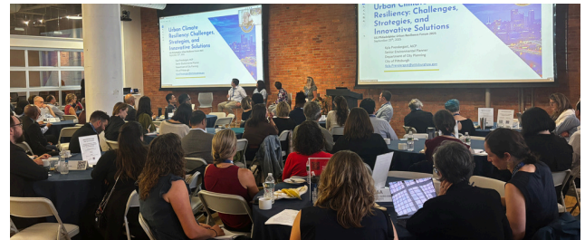
Urban Resilience Forum, September 2025