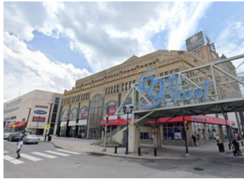
Downtown Upper Darby, April 2025