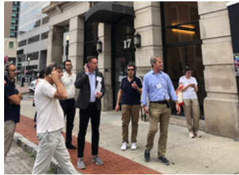
Downtown Harrisburg, June 2025