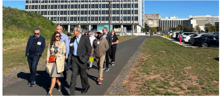
Downtown Trenton, October 2025

Multidisciplinary panels of ULI member experts provide strategic, actionable recommendations that support sustainable growth, equitable outcomes, and informed decision-making across Greater Philadelphia.