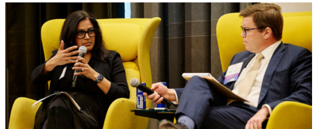
Real Estate Forecast, November 2025