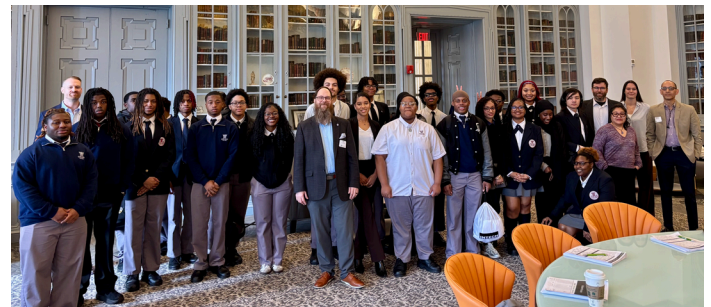
UrbanPlan at Girard College, April 2025

ULI Philadelphia UrbanPlan is a hands-on educational program that introduces high school students, university students, public officials and community members to real estate development and urban planning through experiential learning, teamwork, and mentorship from industry professionals.