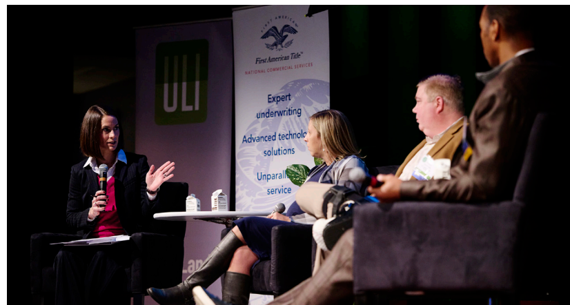
Annual Real Estate Forecast: Local Trends Panel – What's Driving New Investment in the Region?