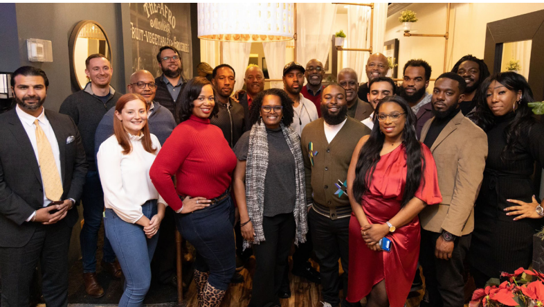
Philly RiSE Real Estate Accelerator Program for Black and Brown developers in Philadelphia, Phase 1 Graduation.