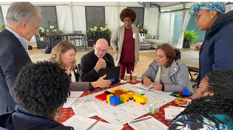
ULI members facilitate an UrbanPlan workshop at the Philadelphia Association of Community Development Corporations' 2022 Conference

Our mission is to shape the future of the built environment for transformative impact in communities worldwide. ULI Philadelphia is one of ULI's largest and most robust District Councils serving Central Pennsylvania, Delaware, Lehigh Valley, and Southern New Jersey in both public and private sectors, with pragmatic land use expertise and education.