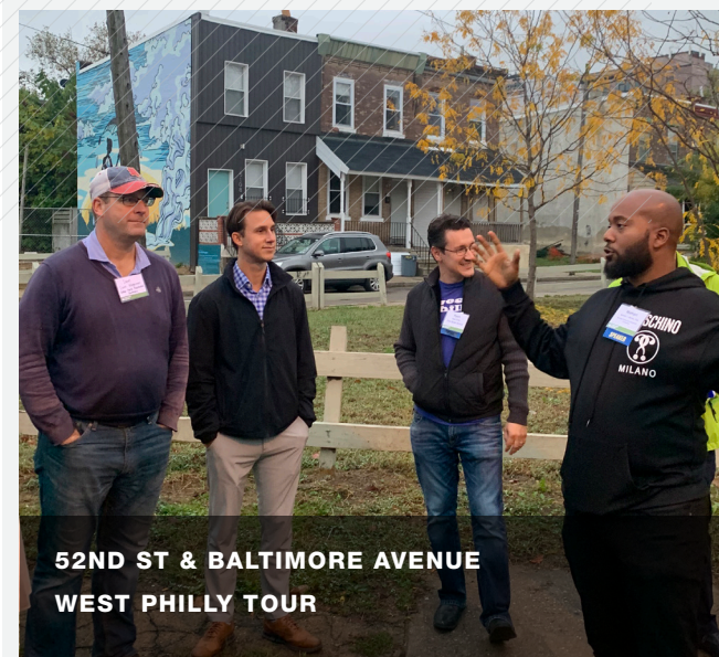
52ND ST & BALTIMORE AVENUE WEST PHILLY TOUR