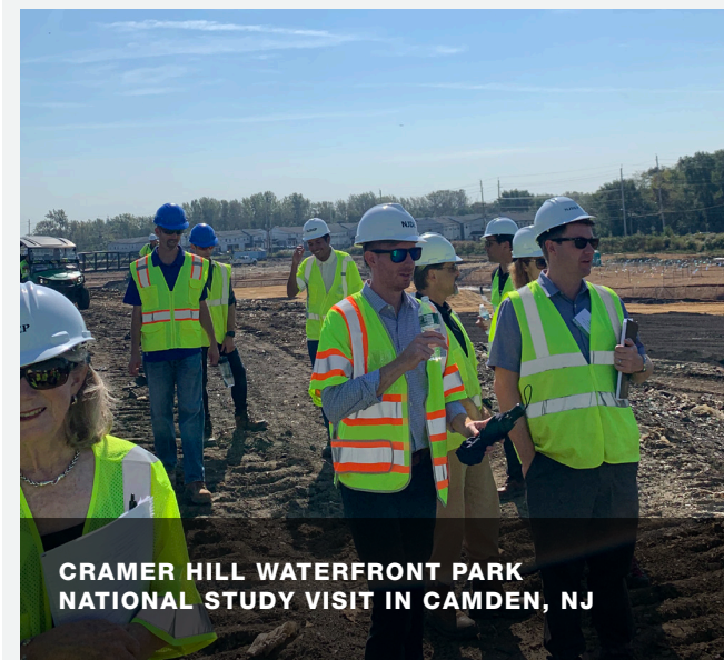
CRAMER HILL WATERFRONT PARK NATIONAL STUDY VISIT IN CAMDEN, NJ