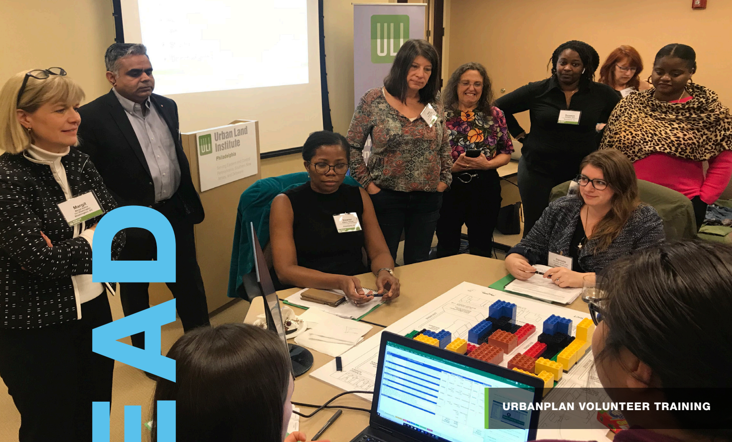
URBANPLAN VOLUNTEER TRAINING