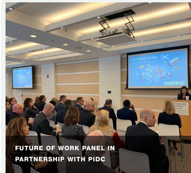
FUTURE OF WORK PANEL IN PARTNERSHIP WITH PIDC