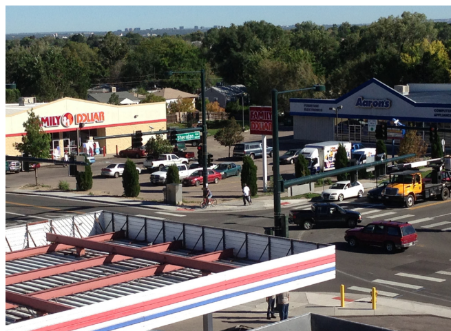
Potential redevelopment site at 10th and Sheridan.