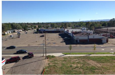
Holiday shops at 10th and Sheridan- a prime redevelopment site.