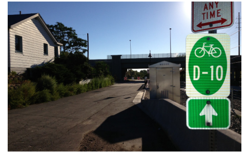
Major bike route connecting Denver and Lakewood.

A major positive is that these two cities have chosen to work together and to collaborate. A key goal of this TAP is to identify logistics and a structure to allow that collaboration to bear fruit. The end result should be vertical, mixed-use development that takes advantage of a major new transit line linked to at least three employment centers.