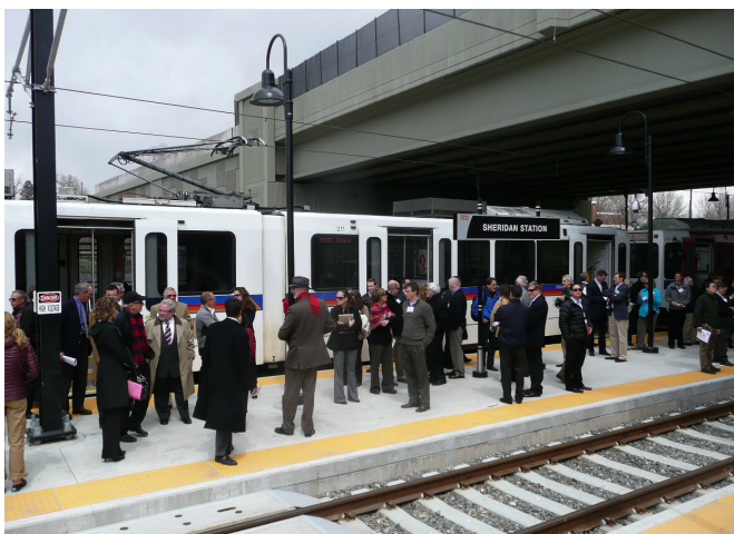
The West Line Corridor opening tour, April 2013, focussed on development opportunities.