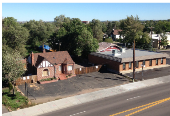
Potential redevelopment site at 10th and Sheridan.