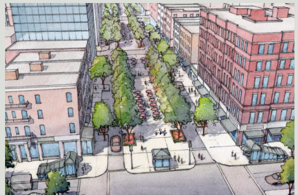
Example of a design to convert an arterial road into a street that functions for pedestrians, bikes and cars