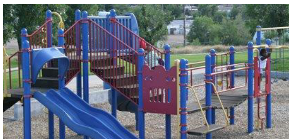
Montair Park in Lakewood is the site of a new urban farm that may be linked to west line station.