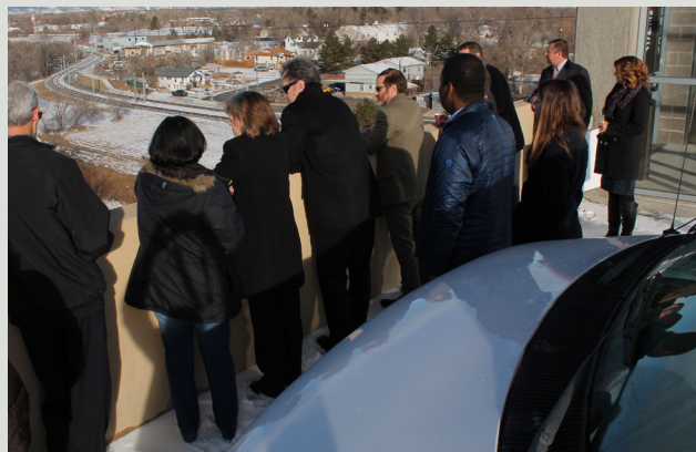
Site tour with TAP panelsits and sponsors.

Offices of economic development and redevelopment in both cases should designate staff “case workers” to work directly with property owners and to generate interest in redevelopment.