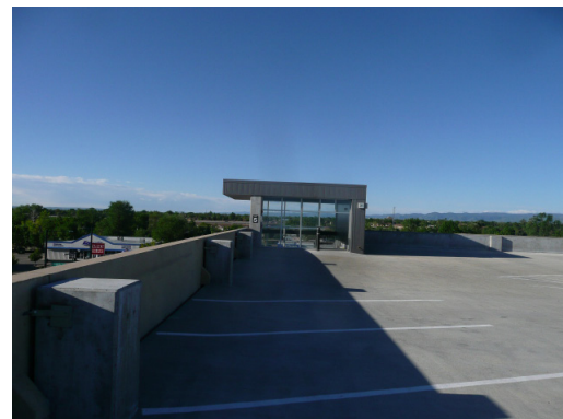
The under used park and ride at 10th and Sheridan.