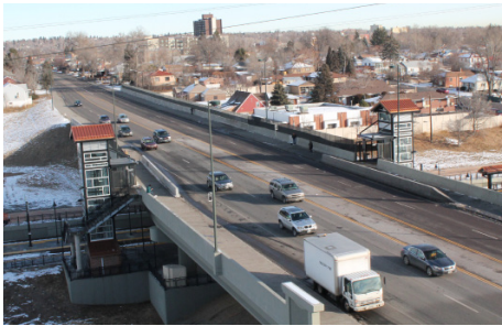
Sheridan Station divides Lakewood and Denver.

The situation is challenging but hardly dire. Numerous neighborhoods that saw no new investment for a generation have come on strong in the last 10 years. Denver’s Highlands and downtown Arvada come to mind.