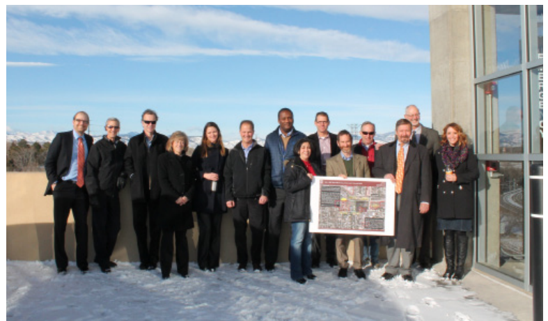
The TAP panel and area stakeholders during a tour of the study area.

Technical Advisory Panels bring ULI Colorado expertise directly into communities on tough real estate problems. TAPs provide advisory panels comprised of ULI Colorado members.