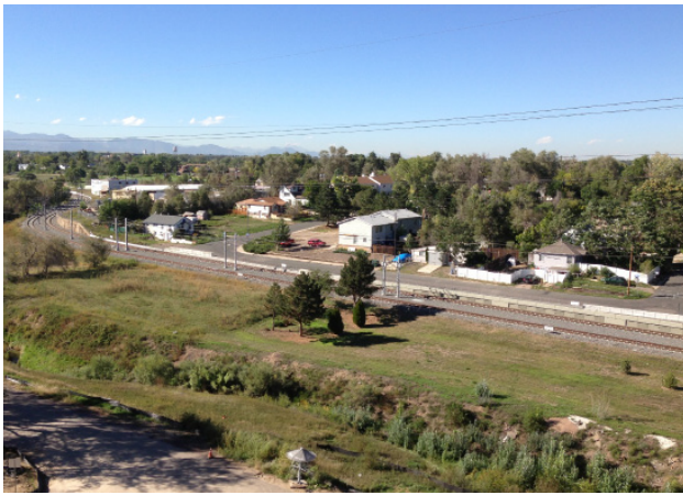
The West Line runs through the Lakewood Dry Gulch.

Plans have been adopted for the Sheridan Station Area, Lakewood/Dry Gulch open space, the Villa Park and Two Creeks neighborhoods, and special Sheridan and Colfax corridor zoning. At least three nonprofit developers, NEWSED, Rocky Mountain Communities, and the Urban Land Conservancy, have acquired land and advanced toward creating new projects around the station at 10th and Sheridan. Nonprofits like the West Line Corridor Collaborative (WLCC), and Denver and Lakewood Colfax business improvement districts have made positive, community-minded development around the station a high priority.