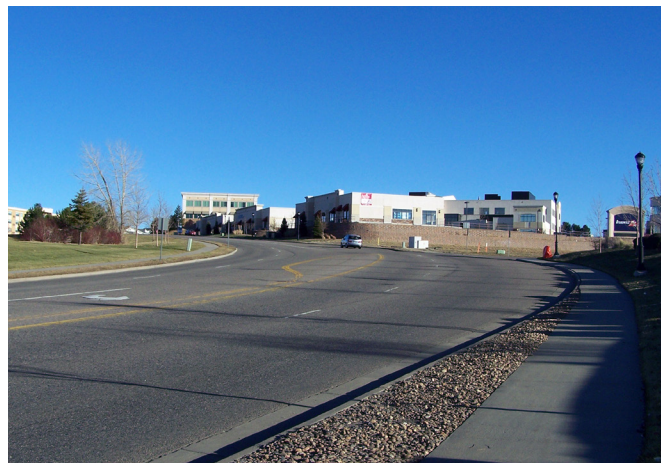
Park Meadows Drive is too wide and fast for pedestrians and cyclists but could be retrofitted to be friendlier to people and transit

By the nature of their newness, communities such as Lone Tree have just begun to mature as places. They were also shaped by an auto-dominated culture that is starting to change as appealing alternatives such as light rail, bikeways, and shady pedestrian paths emerge as part of the suburban landscape.