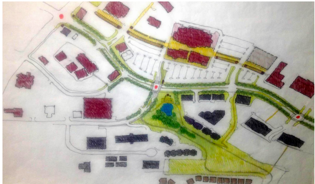
Top: Boundaries of the Entertainment District, whose original vision was never realized. Bottom: The panel's vision for a revamped entertainment district built around connections, public places, and green space.