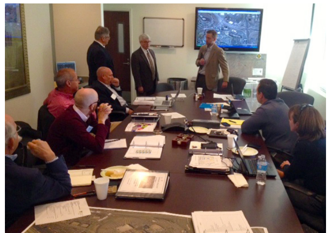
City officials present to the ULI panel