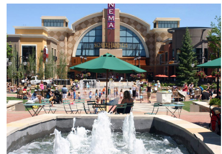
The panel cited examples of placemaking from Colorado and elsewhere. Walkability, water, shade, public art and an up-to-date cinema are seen as key to attracting new business and social vitality to the Entertainment District