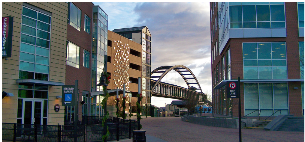
Although RTD's light rail station is not in the Entertainment District, the proximity of transit creates a major opportunity.