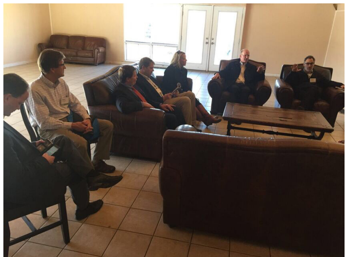
Stakeholder interview held at the Meadows Mobile Home Park.