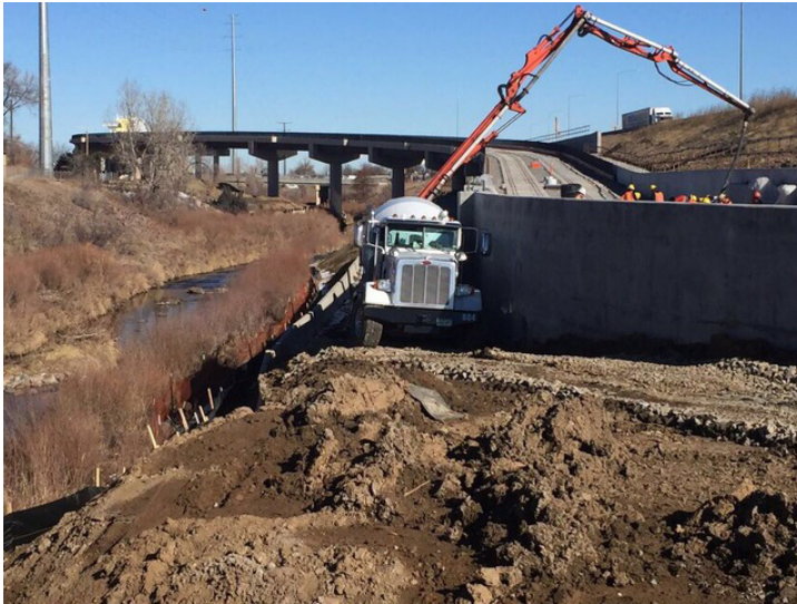
Toll Gate Creek presents a floodplain challenge but also an opportunity for amenity on site.