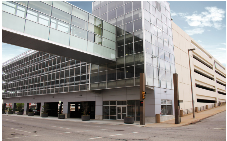
An example of an upper level parking garage bridge. This could be used to create a more usable west-side development site.

A direct connection to AMC facilities may set the stage for future commercial development related to medical uses.