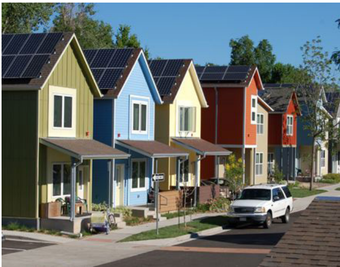
Red Oak Park, winner of a 2012 ULI Global Award for Excellence, replaced 59 low-quality mobile homes with a beautiful, shaded New Urbanist neighborhood with almost 100 percent of the original residents returning to live there. The panel cited this as an example of replacement housing that could work at the 32.7-acre Meadows Mobile Home Park next to the station.