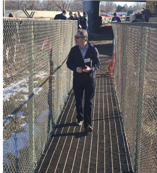
Getting pedestrians, cars and cyclists across or around tracks to potential development sites presented one of the panel's major challenges.

its capacity to handle traffic and parking. This may create opportunities to host new medical-related facilities along the R line with access to AMC and to future projects developed by the Fitzsimons Redevelopment Authority.