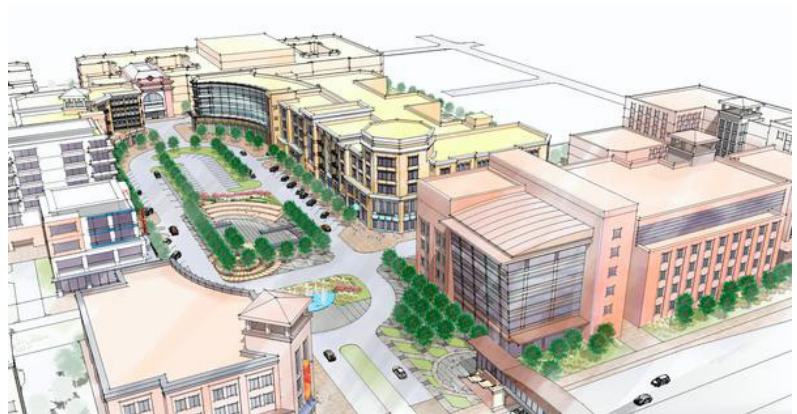
Forum-Fitzsimons, which broke ground October 2015, provides an example of market-rate housing rising near transit in the corridor. The project provides almost 400 market-rate apartments, 28,000 square feet of retail at East Colfax and Potomac Street.

Given local apartment leasing rates, the site ultimately may attract market-rate podium apartments, perhaps similar to the high-density, mixed-use Forum at Fitzsimons. The site should be branded for its convenience to jobs at AMC/Fitzsimons, Buckley, and