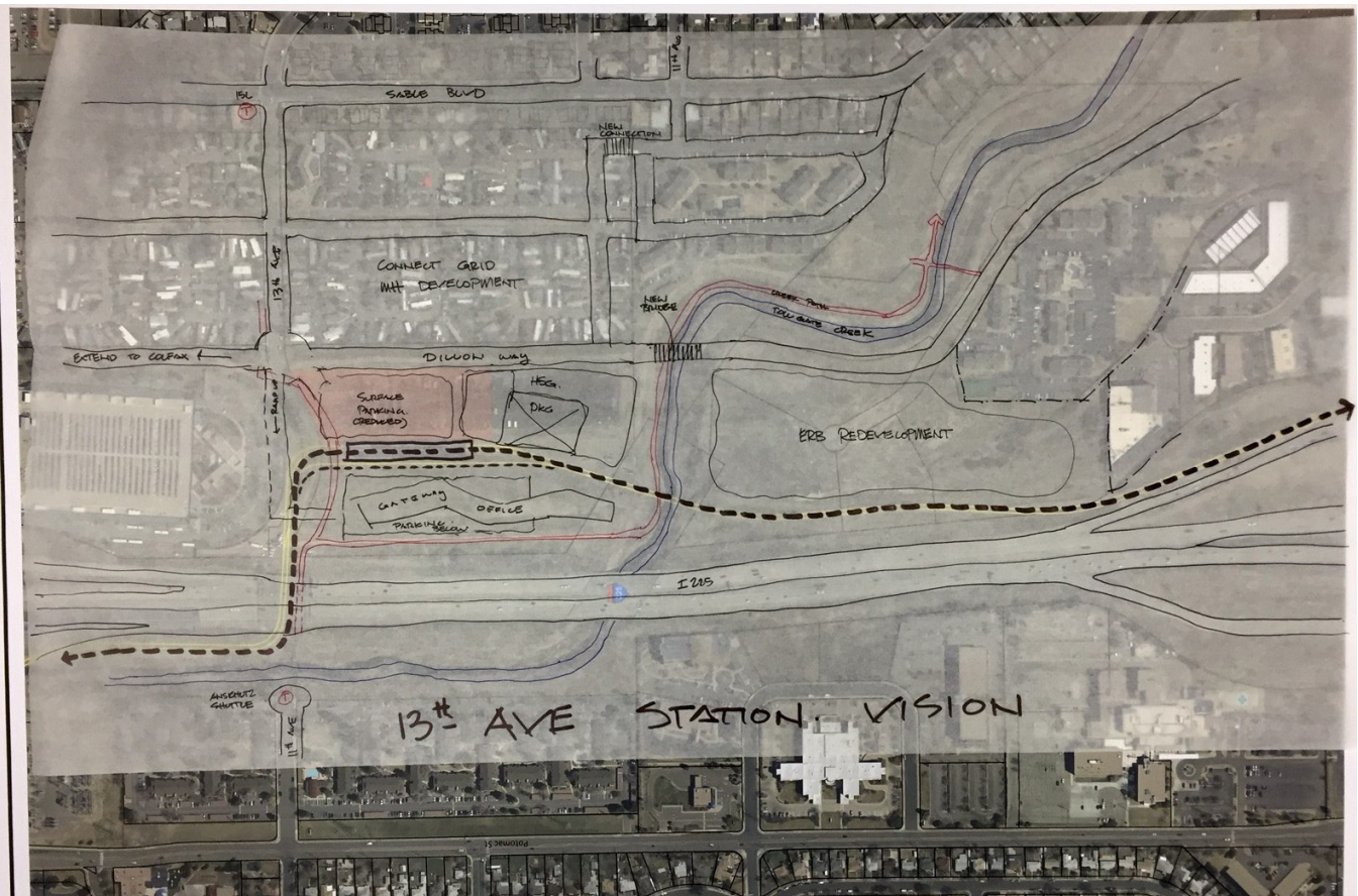
Panelist drafted this "vision map" showing new development sites, street grid, and east-west site connections for pedestrians, bikes and cars.