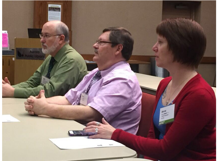
Aurora public officials being interviewed by the ULI panel.

“The extension of Dillon Way is necessary for the site to develop...it also gives an opportunity to create an enhanced gateway into the station early on while lowering the amount of traffic cutting through the mobile home park to the west. Future redevelopment of the mobile home park (with east station site as a receiving site) creates an opportunity to make an enhanced gateway along 13 th .”