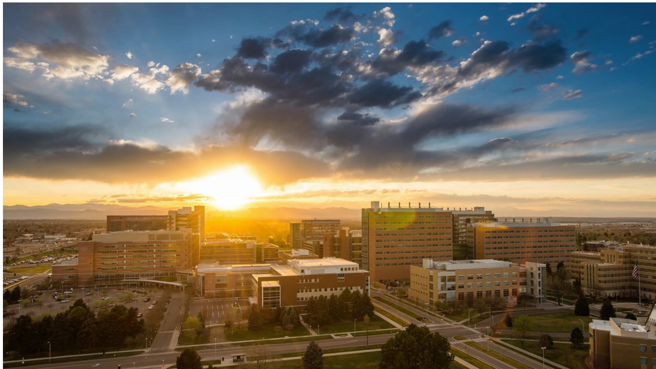
Growth at the AMC has come faster than anticipated. Traffic and parking issues may cause some clinics to move off campus.