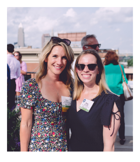
Bar Sponsor / $750