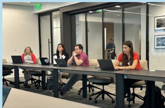
Image: Photo showing the stakeholders at the TAP workshop; Credit: ULI Charlotte.