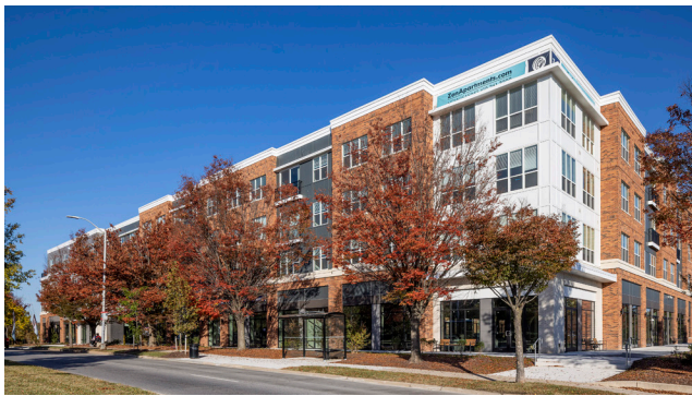
TOP Open lobby with expansive windows and featured moss wall BOTTOM Corner facing street view of exterior