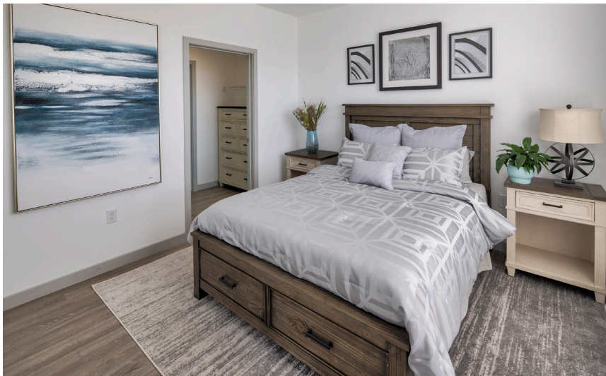
TOP LEFT Open concept residential unit TOP RIGHT Residential living space BOTTOM Residential bedroom unit