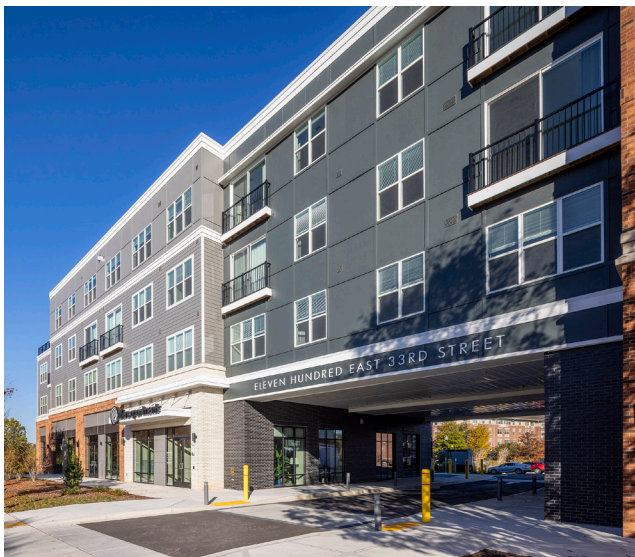
TOP Stadium Place's location within the Stadium Place community BOTTOM Accessible parking entrance from East 33rd Street