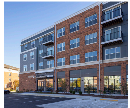
TOP LEFT Residents' lounge with terrace and cityscape views TOP RIGHT Front facing street view looking down Ednor Road BOTTOM Commercial lobby with residential units above viewed from parking lot

There are several visionary approaches to the project. Many urban mixed-used projects integrate only a small commercial component such as a coffee shop, while Village Center at Stadium Place dedicates an entire floor to retail and further expands the concept by adding 9,000 square feet of commercial office space to the second level. By fronting the commercial on both the East 33 rd and parking lot sides, it serves to invite in both the population of Stadium Place and the neighborhood. Another fairly unique feature relates to the amenity space. The residential amenity space is most frequently at the ground level, placing it at the top level creates unique opportunities for views and a wonderful rooftop terrace. This project adds to the initial vision of Stadium Place as an urban mixed-use, mixed-income senior living community.