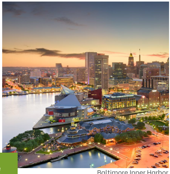
Baltimore Inner Harbo

ULI's 46,000 members worldwide represent the entire spectrum of land use and real estate development disciplines in private enterprise and public service dedicated to creating better places.