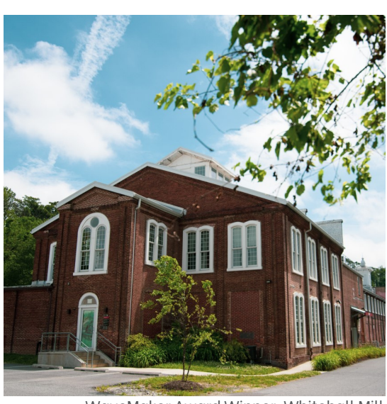
WaveMaker Award Winner: Whitehall Mill