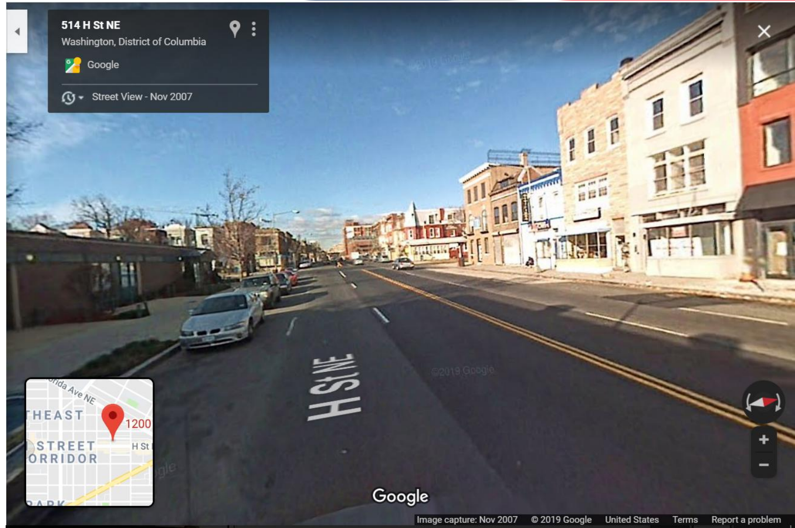
500 Block of H St NE in 2007