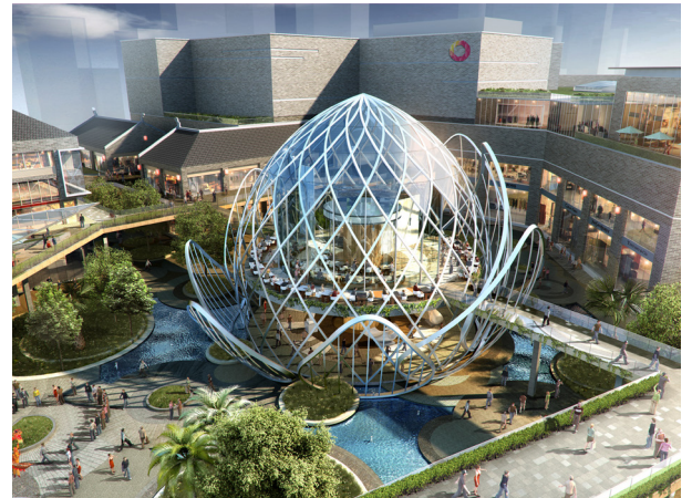
Pluit City Mixed-Use Commercial District, Jakarta, Indonesia