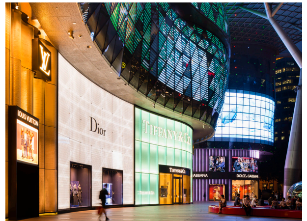
ION Orchard, Singapore