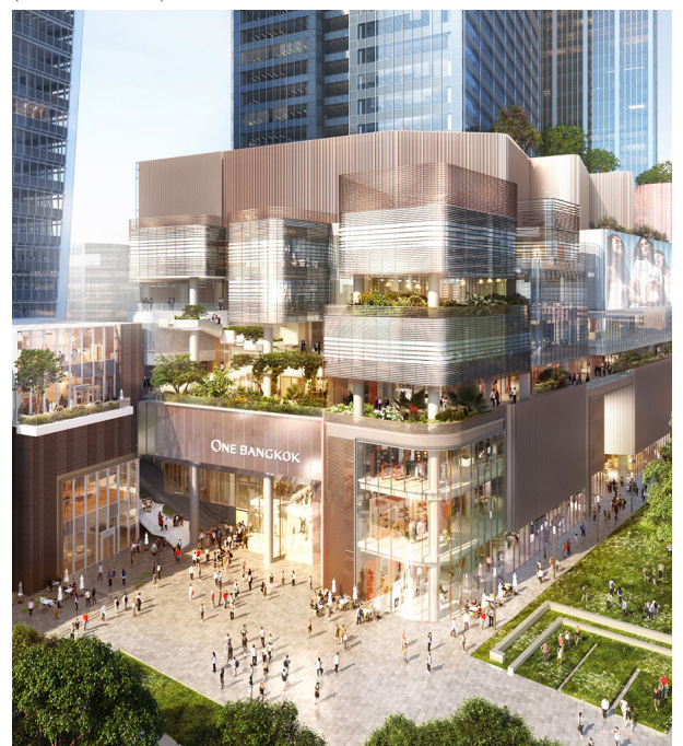
One Bangkok Retail Podium, Bangkok, Thailand (whilst at Lead8)