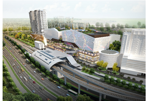
Subang Jaya City Centre, Selangor, Malaysia