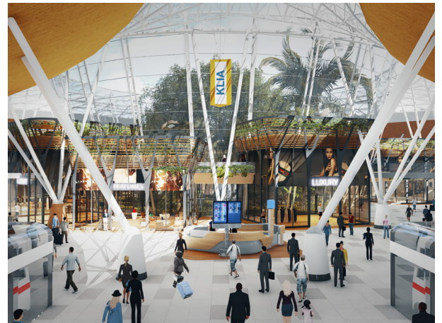
Kuala Lumpur International Airport Satellite Building Commercial Reset, Kuala Lumpur, Malaysia (whilst at Lead8)

ION Mall, Singapore Westgate Mall, Singapore Great World City Retail Enhancement, Singapore Toppen Shopping Centre, Johor Bahru, Malaysia Watergardens Town Centre, Melbourne, Australia