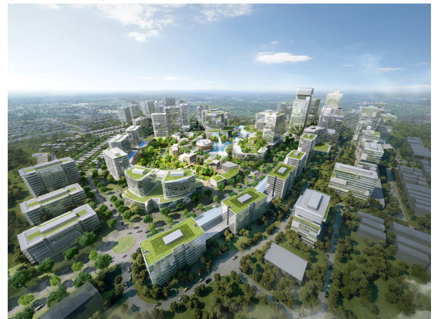
Wiraland Southcity Masterplan, Jakarta, Indonesia (whilst at Lead8)