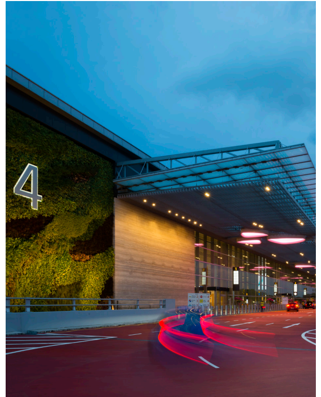
Terminal 4 Changi Airport, Singapore

Forming the gateway to the iconic 160 hectare modern bayfront island, the Pluit City Cultural Village will offer contemporary world-class entertainment and retail offerings within an urban network of laneways, plazas and social nodes – all inspired by the traditional Chinese shophouse. Only 20km from Jakarta's international airport, the 125,000sqm development will consist of a 350-room Hotel, Office Suites, a 4 level Retail Mall, F&B, Speciality Retail and Pluit City's own Marketing Gallery. The shophouse inspired architecture will be a modern and contemporary interpretation of traditional Chinese elements, creating a unique and attractive destination for the Pluit area.