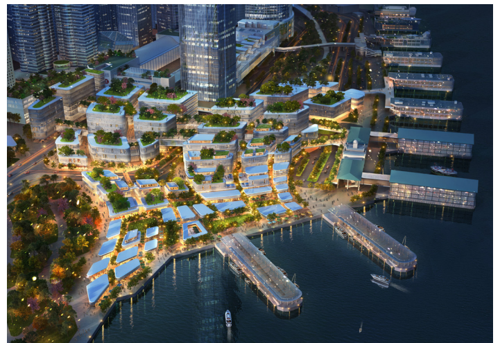
Site 3 Central Harbourfront Hong Kong