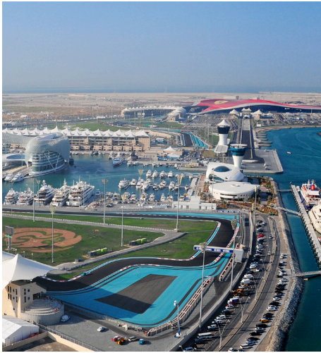
Yas Island Concept Masterplan, Abu Dhabi, UAE