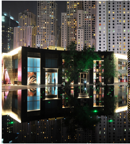
The Beach, Dubai, UAE