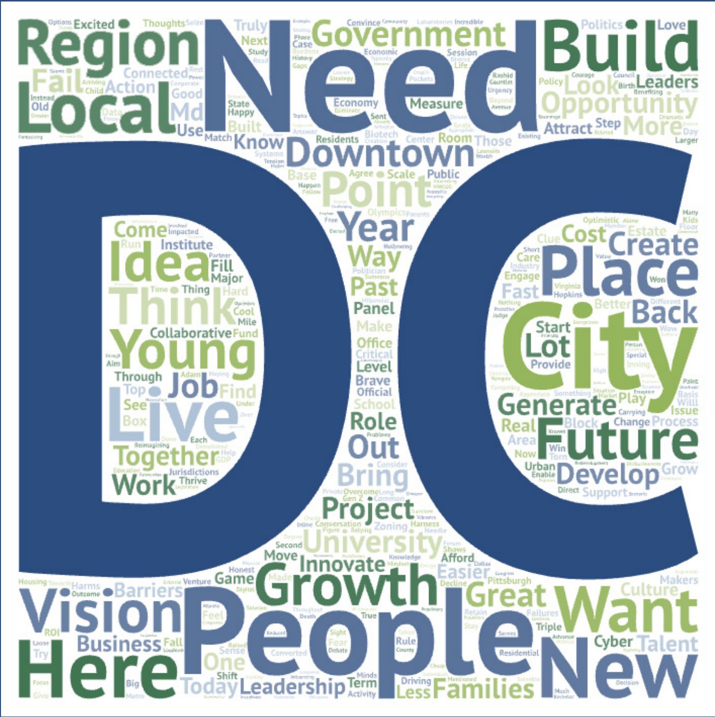
Word Cloud generated from "What I'm Thinking" survey results at Future Forum 2024