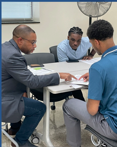
UrbanPlan at the REEX Summer Scholars Program