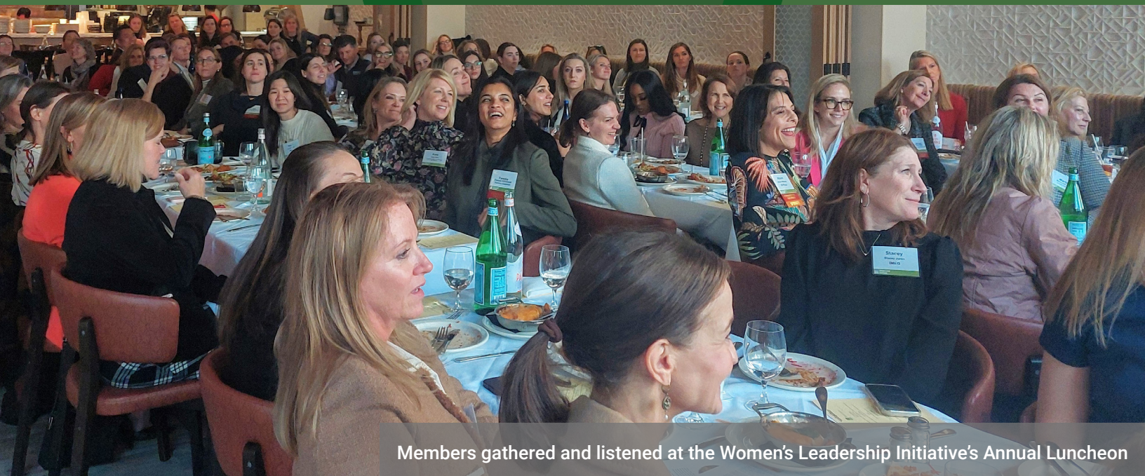
Members gathered and listened at the Women's Leadership Initiative's Annual Luncheon