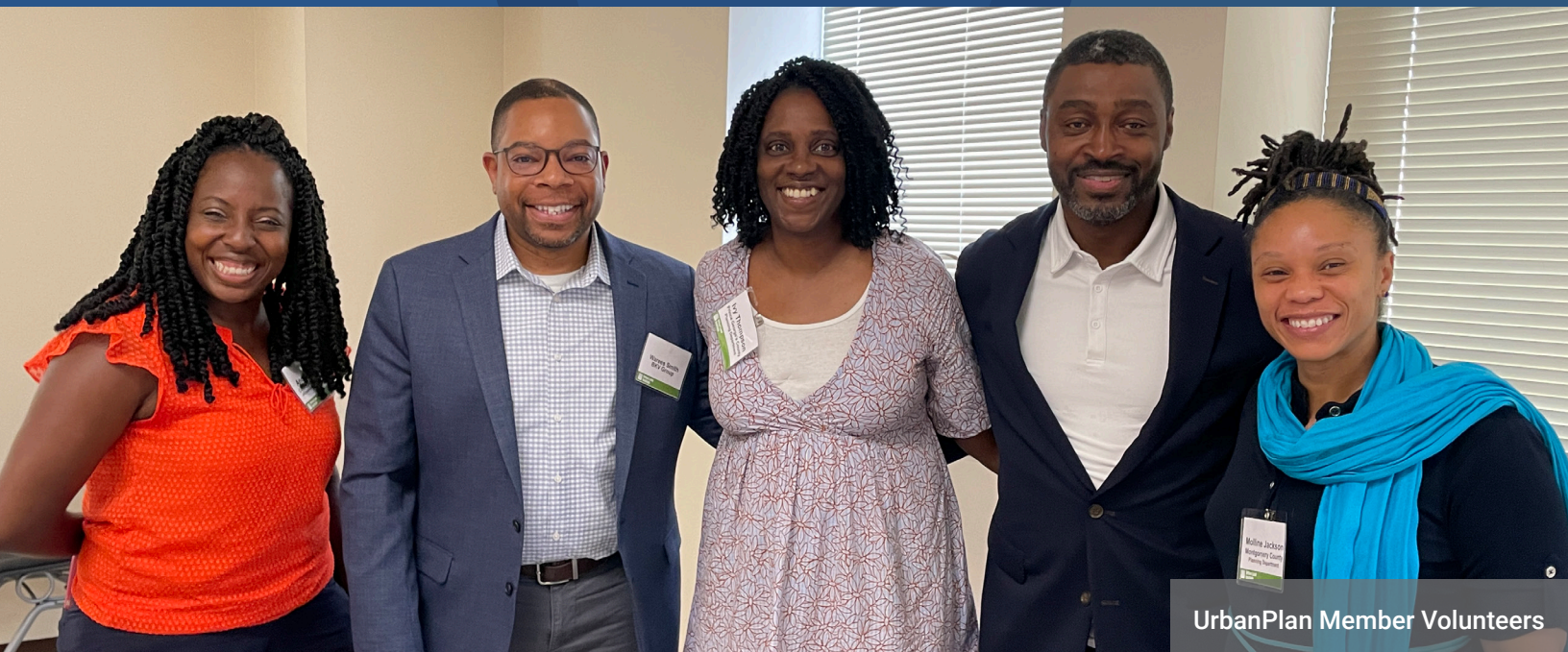
UrbanPlan Member Volunteers

Total partnership dollars raised in 2024: $427,250