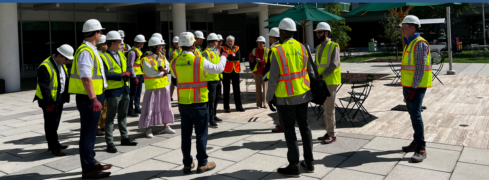
Members on a site tour of Fuse at Mason Square hosted by YLG Education

Through educational programs that include formal mentorship, classroom-based modules for students, experiential learning, educational site tours, thought provoking programs, and executive professional development, ULI supports and cultivates the next generation of diverse leaders.