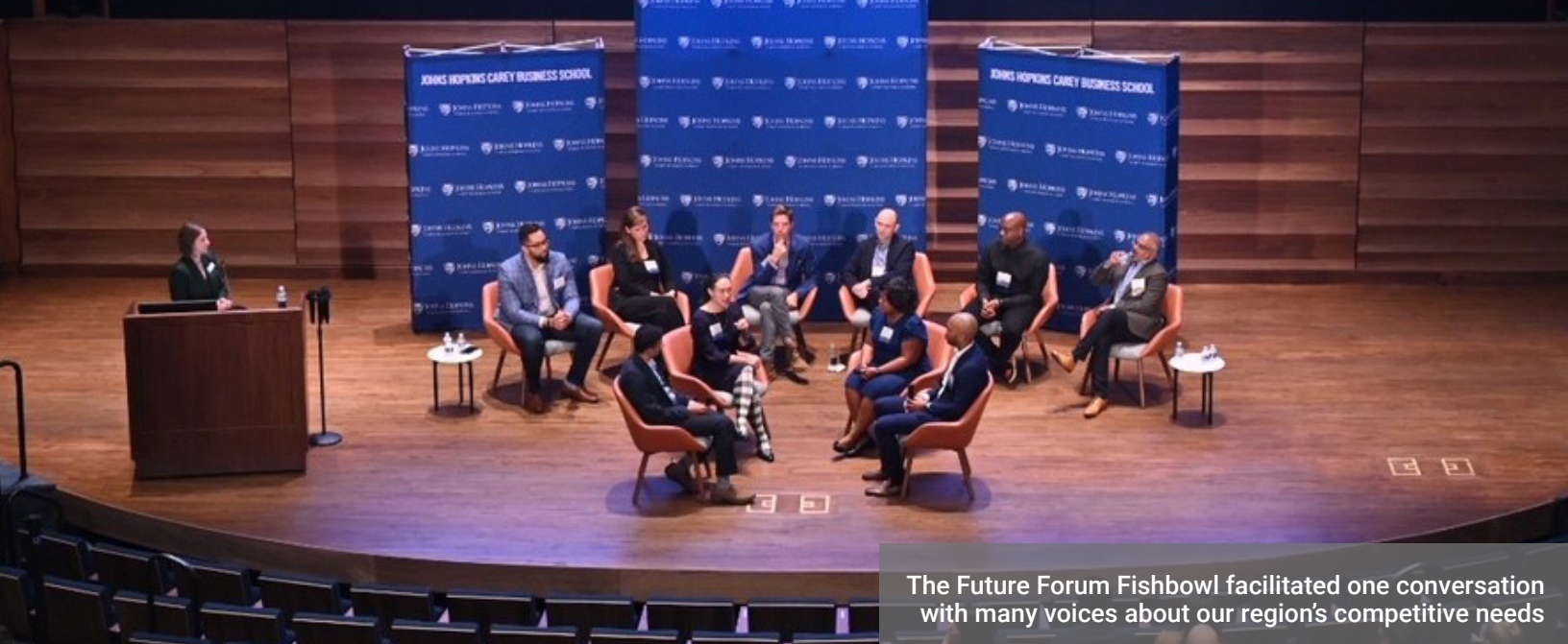
The Future Forum Fishbowl facilitated one conversation with many voices about our region's competitive needs