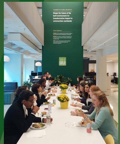
Full Member Luncheon at ULI's Headquarters