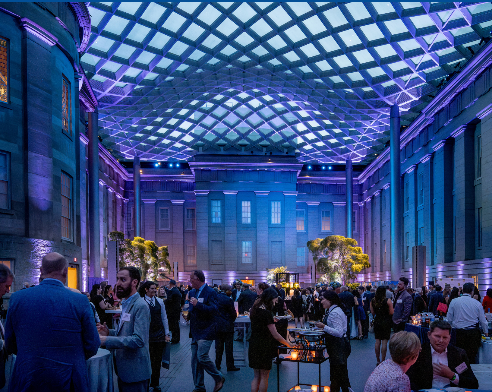
Reception in the National Portrait Gallery's Kogod Courtyard at ULI Washington's Awards for Excellence