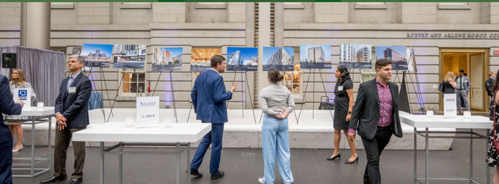
Projects nominated for Awards on display at ULI Washington's Awards for Excellence