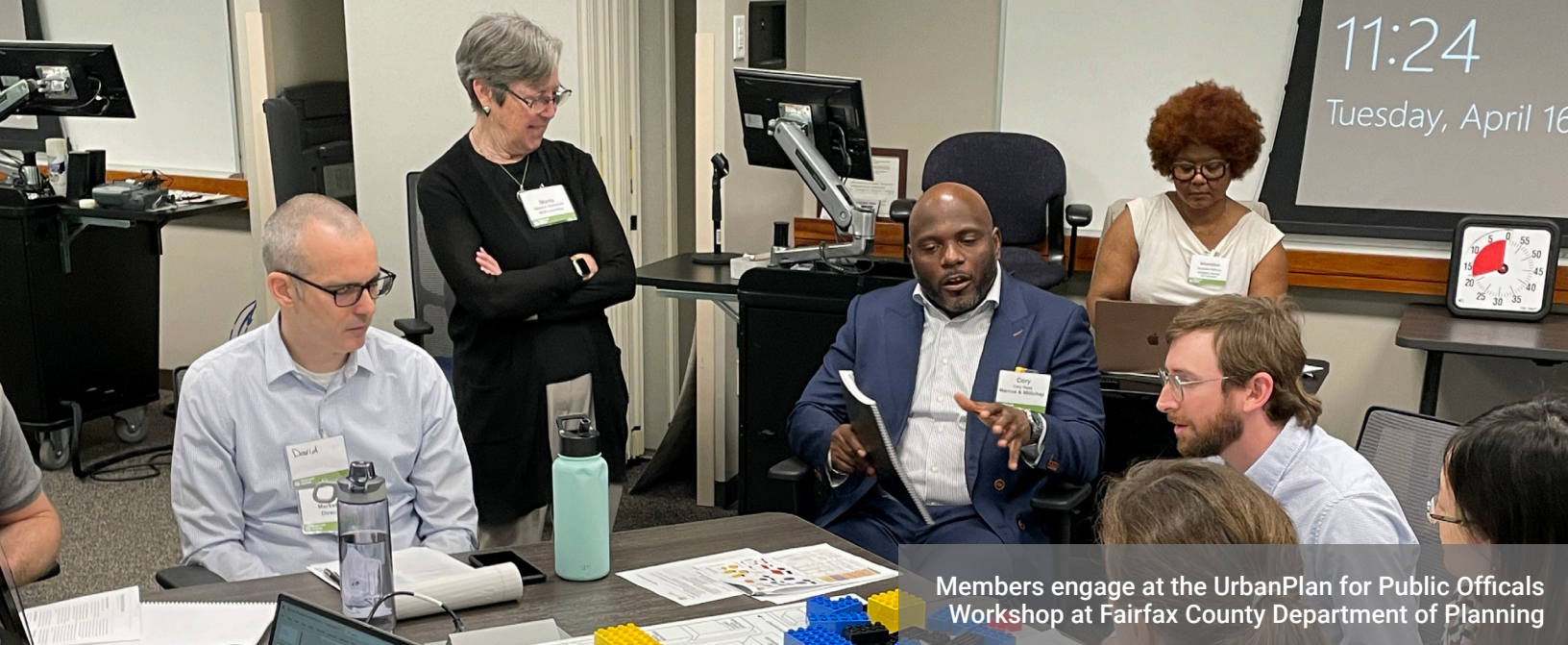
Members engage at the UrbanPlan for Public Officials Workshop at Fairfax County Department of Planning