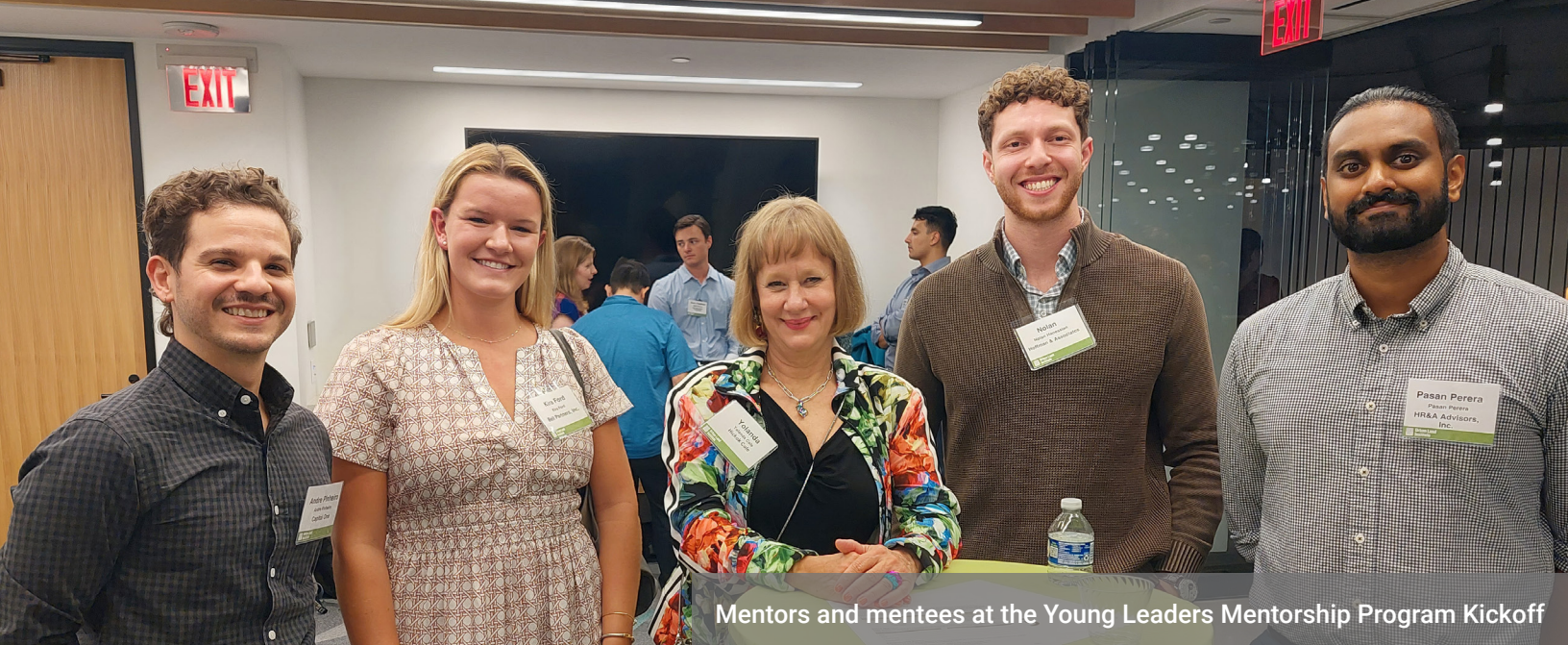
Mentors and mentees at the Young Leaders Mentorship Program Kickoff