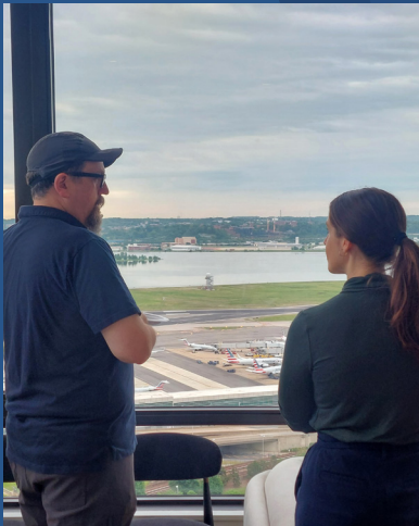
Leadership Institute cohort members tour The Grace Apartment Complex