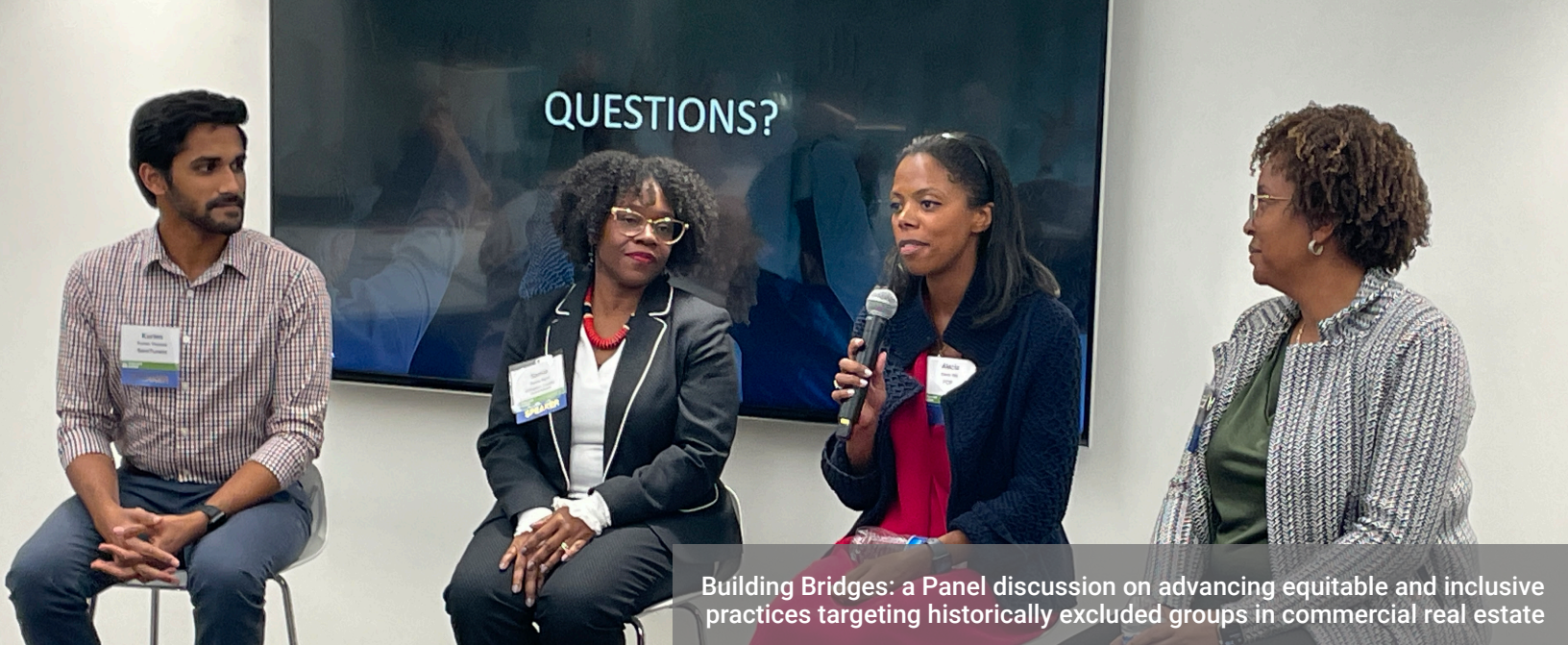
Building Bridges: a Panel discussion on advancing equitable and inclusive practices targeting historically excluded groups in commercial real estate