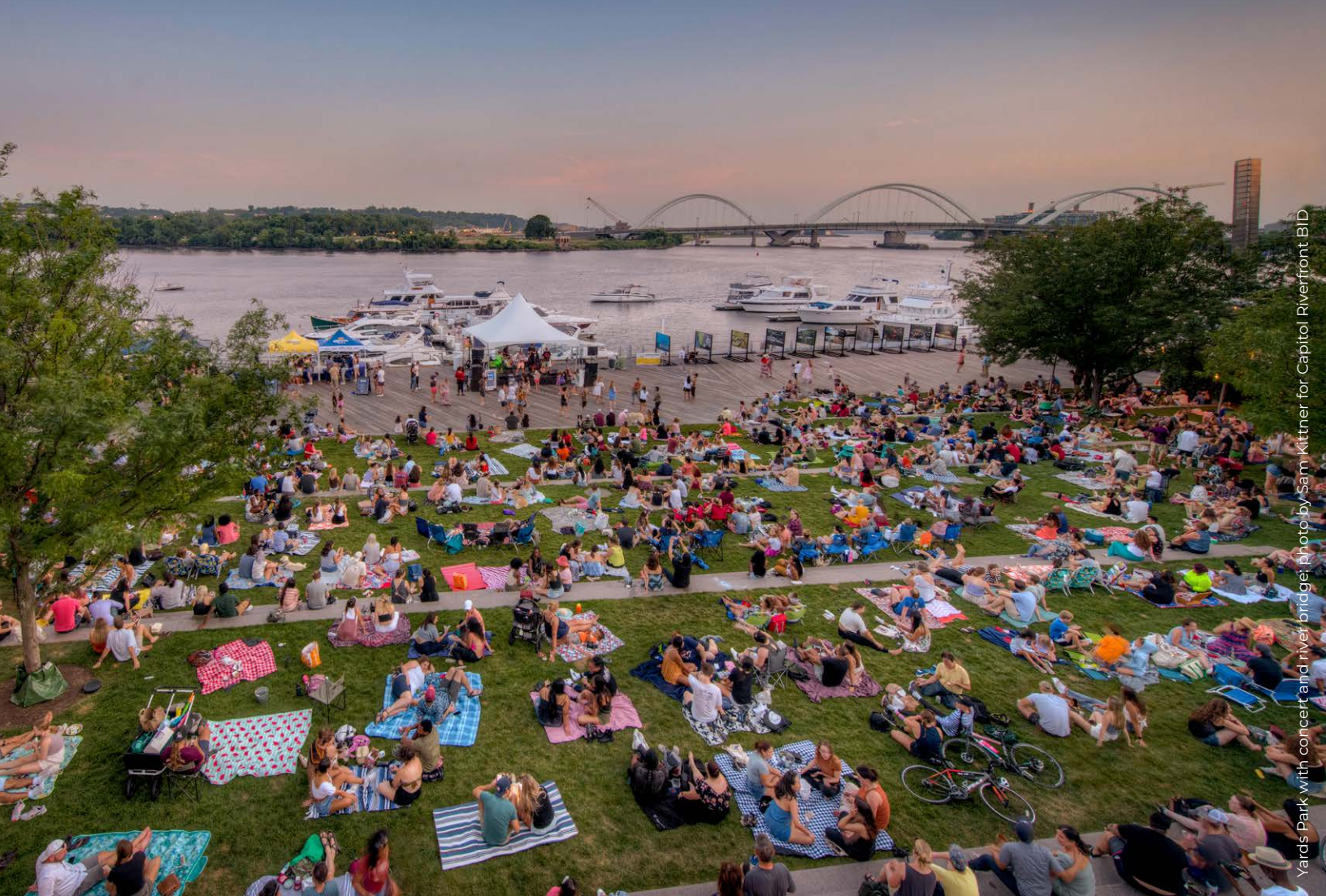
Yards Park with concert and river bridge

ULI is a global, member-driven organization comprising more than 45,000 real estate and urban development professionals dedicated to advancing the mission of shaping the future of the built environment for transformative impact in communities worldwide. ULI Washington, a district council of ULI, delivers this mission through programs and initiatives for the more than 2,200 members in the Metropolitan Washington Region.