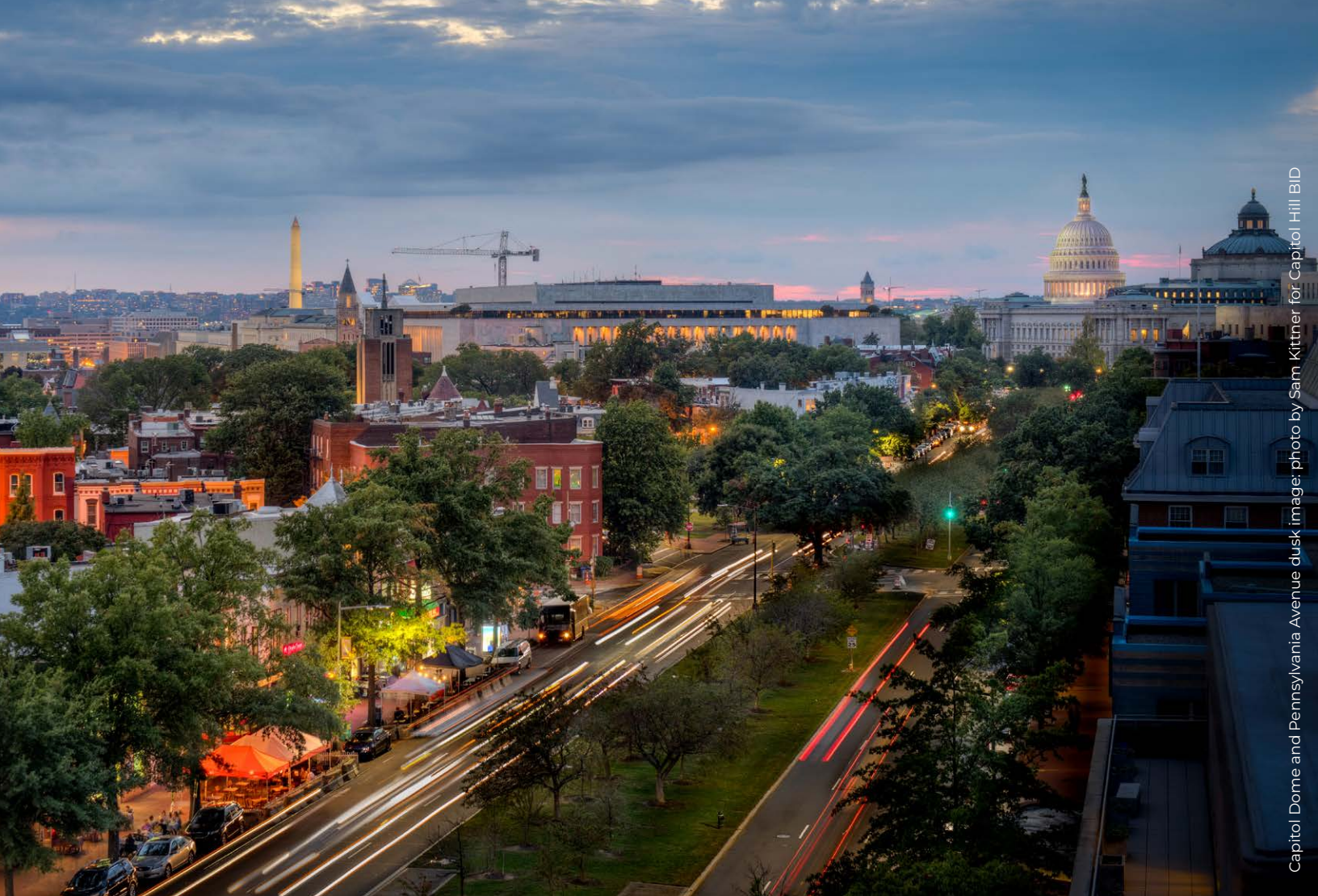
Capitol Dome and Pennsylvania Avenue dusk image: photo by Sam Kittner for Capitol Hill BID