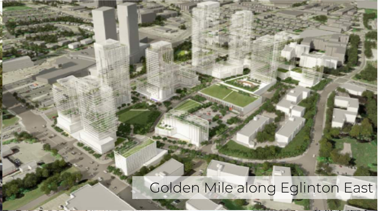
Golden Mile along Eglinton East