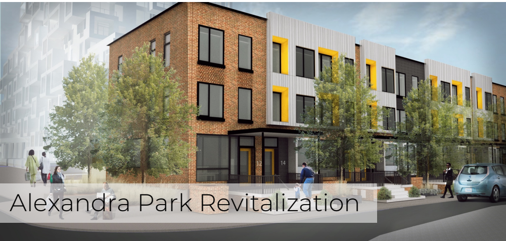
Alexandra Park Revitalization