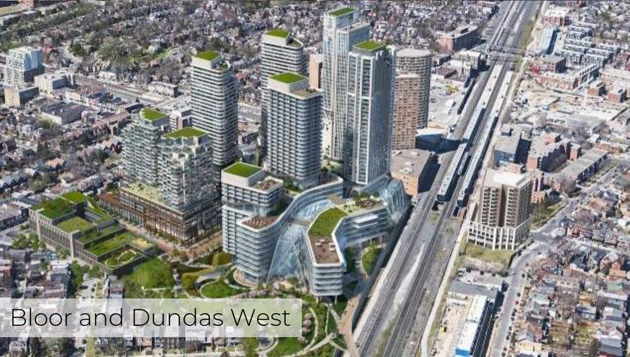
Bloor and Dundas West