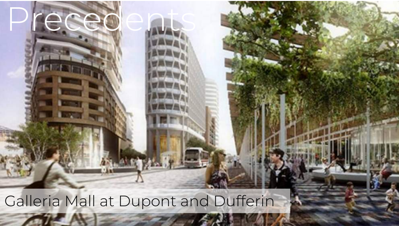
Galleria Mall at Dupont and Dufferin