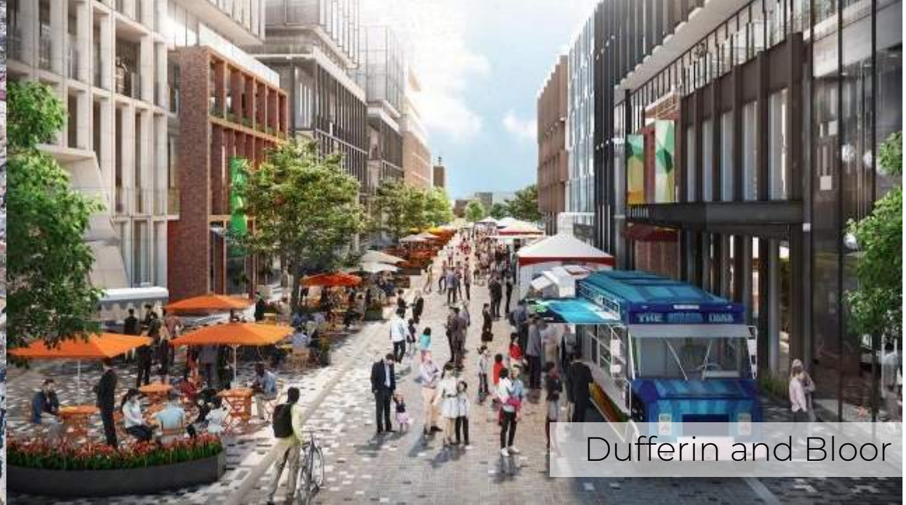
Dufferin and Bloor