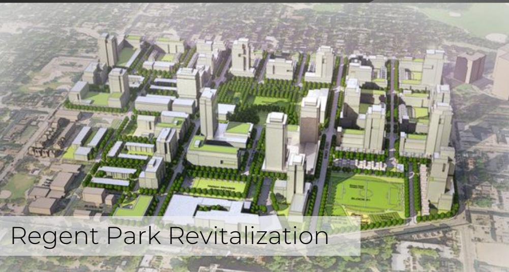
Regent Park Revitalization