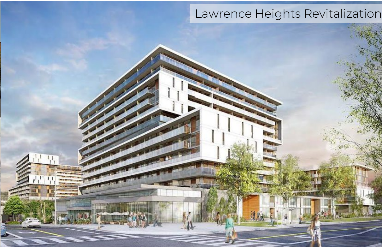
Lawrence Heights Revitalization