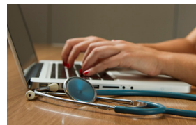
Healthcare facilities & Hospitals