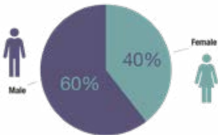
Membership by Gender