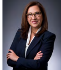
Ana Bailão Deputy Mayor, City of Toronto