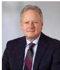
Stephen Poloz , Special Advisor, Osler LLP and Author, The Next Age of Uncertainty and Former Bank of Canada Governor