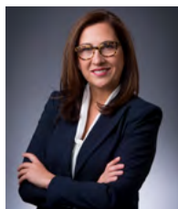
Ana Bailão Deputy Mayor, City of Toronto