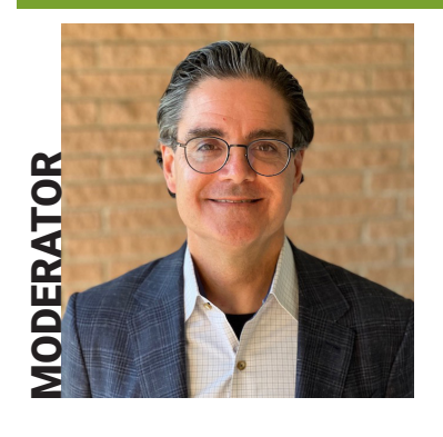
Cullum Clark Bush Institute