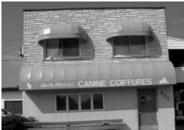
Existing downtown housing above retail should be upgraded through code enforcement and façade improvements.

The retail approach should include developing public policy strategies to encourage reinvestment, including utilizing shared commercial parking requirements to allow for more dense development, and a more effective downtown marketing program.