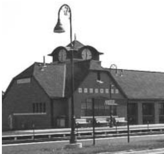
A new train station in downtown Highwood provides an anchor to nearby redevelopment opportunities.