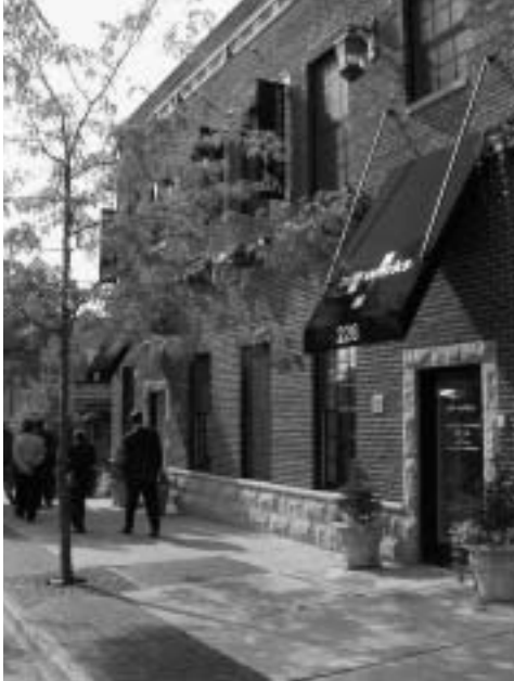
This redevelopment of a Highwood retail strip provides an example that can be replicated.

Highwood's retail development lacks basic services. The most recent development includes two small strip malls outside the traditional downtown across from the entrance to Ft. Sheridan, and a new bank and pharmacy across from City Hall and adjacent to the train station that are scheduled to open in 2003. Other new businesses have appeared: an art gallery – opened by a hometown graphic designer who returned to Highwood – across from the future pharmacy, and Chicago Brass, an upscale plumbing fixtures supplier that relocated from a nearby suburb, reportedly because of lower rents. Many of the other newer retail stores – primarily updated small grocery stores – exclusively serve the growing Latino population.