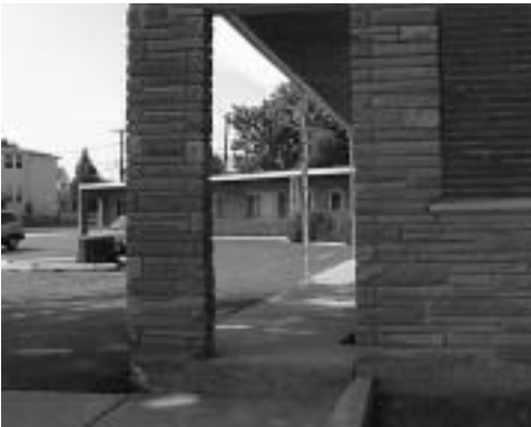
Existing downtown housing should be renovated.

the currently sub-standard housing in the downtown area, improving code enforcement and establishing tax incentives to pay for improvements. We want to create housing options across the income spectrum.”