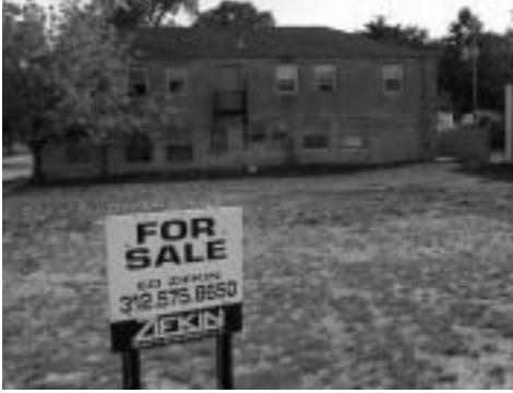
A vacant downtown parcel available for condominiums at the corner of Walker and Waukegan roads.

Among other recommended housing strategies was City assistance for land assemblage, something that could be possible since the City already controls a number of sites at the corner of Walker and Waukegan roads and a number of others are up for sale.