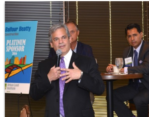
Mayor Steven Adler providing opening remarks at a ULI breakfast.