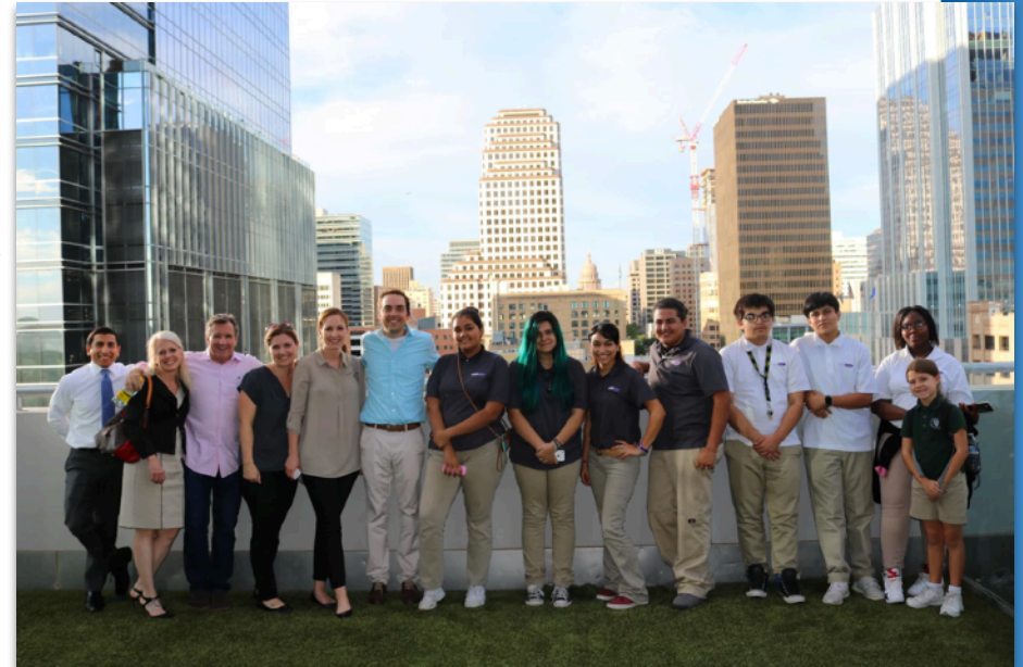
Students and mentors from #BTN touring the Austonian with Momark Development