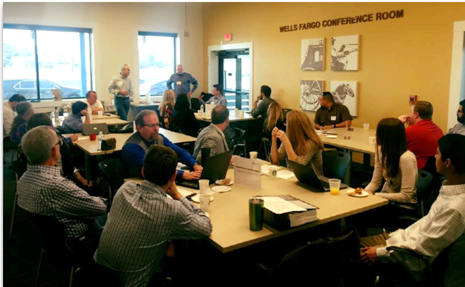
CodeNEXT Roundtables meeting to discuss small group work and next steps to present findings to the City of Austin.

Roundtable discussion groups are formed periodically utilizing ULI Austin members to address current issues within the region. The CODENEXT roundtables, currently underway, are focused on the new code in the City of Austin. They are creating white papers on specific issues that can be utilized by ULI members to discuss code changes with their firms and elected officials. Please contact Cheryl McOsker to learn more.