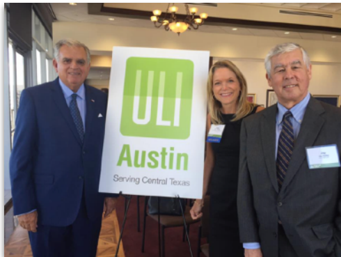
Former United States Secretary of Transportation, Ray LaHood speaking to ULI Annual Sponsors.