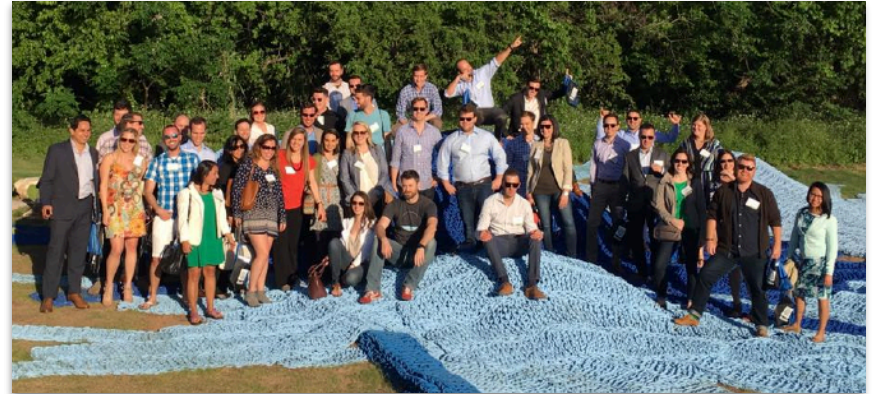
Young Leaders at Waller Creek art installation.