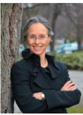
Dianne Saxe Environmental Commissioner of Ontario (ECO)