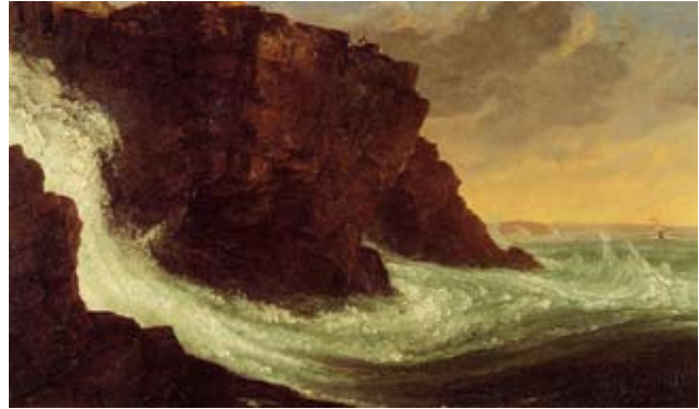
"Frenchman's Bay, Mt. Desert Island," by Thomas Cole, c.1844.

Market Northeast Harbor. Based on the kinds of activities developed, the town should develop a marketing strategy that uses the internet and mobile devices, as well as more traditional means, to get the word out to a broader audience about what Northeast Harbor has to offer (both generally and for specific events), during the high summer season, as well as the so called shoulder seasons.