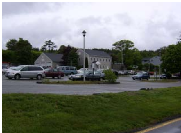
Parking lot adjacent to the Town offices at the marina.