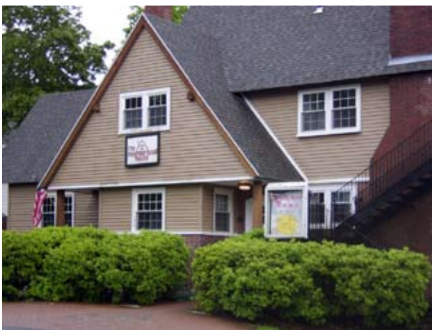
The Neighborhood House

The permitting process required by the Town is reported to be overly onerous for the kinds of development allowed by right through the town's zoning ordinance. This appears to be especially so with respect to review pursuant to the sign ordinance.