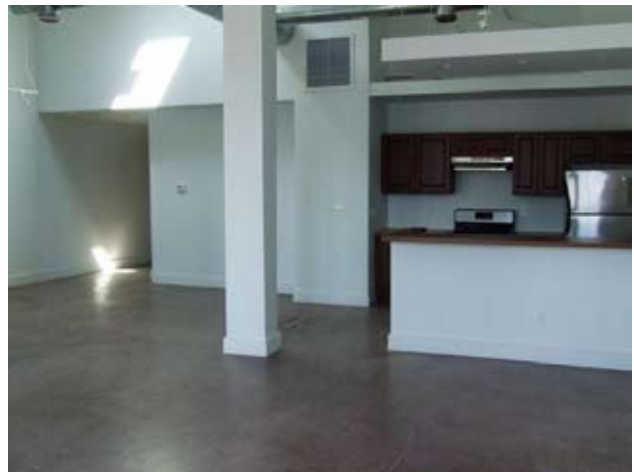
This artist live/work unit has a simple layout with minimal finishes.

The proposed partnership with College of the Atlantic for the greenhouse is one example of leveraging institutional assets on the island and Northeast Harbor should seek out other opportunities to leverage these resources. Northeast Harbor should remain open to the possibility of a small professional or training school choosing to locate in the village, which could inject students, faculty, and their visiting families and friends. An ideal institution would be one that would provide opportunities for local residents and be successful enough to draw students from off island. A culinary school with a hospitality component would be one idea.