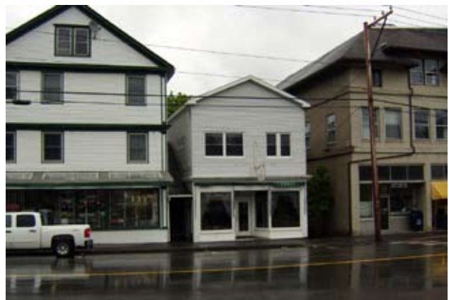
Reasonably priced and renovated upper floor apartments on Main Street could bring life to the village center.

There are at least two major employers that create annual, ongoing year-round markets in housing and basic goods: Mount Desert Island Hospital (Bar Harbor) and The Jackson Laboratory (Bar Harbor). Efforts could be made to enlist these institutions as partners in larger scale efforts to create more affordable workforce housing in Northeast Harbor, but, even if they are not interested in partnering in development, they provide an opportunity for focused marketing.