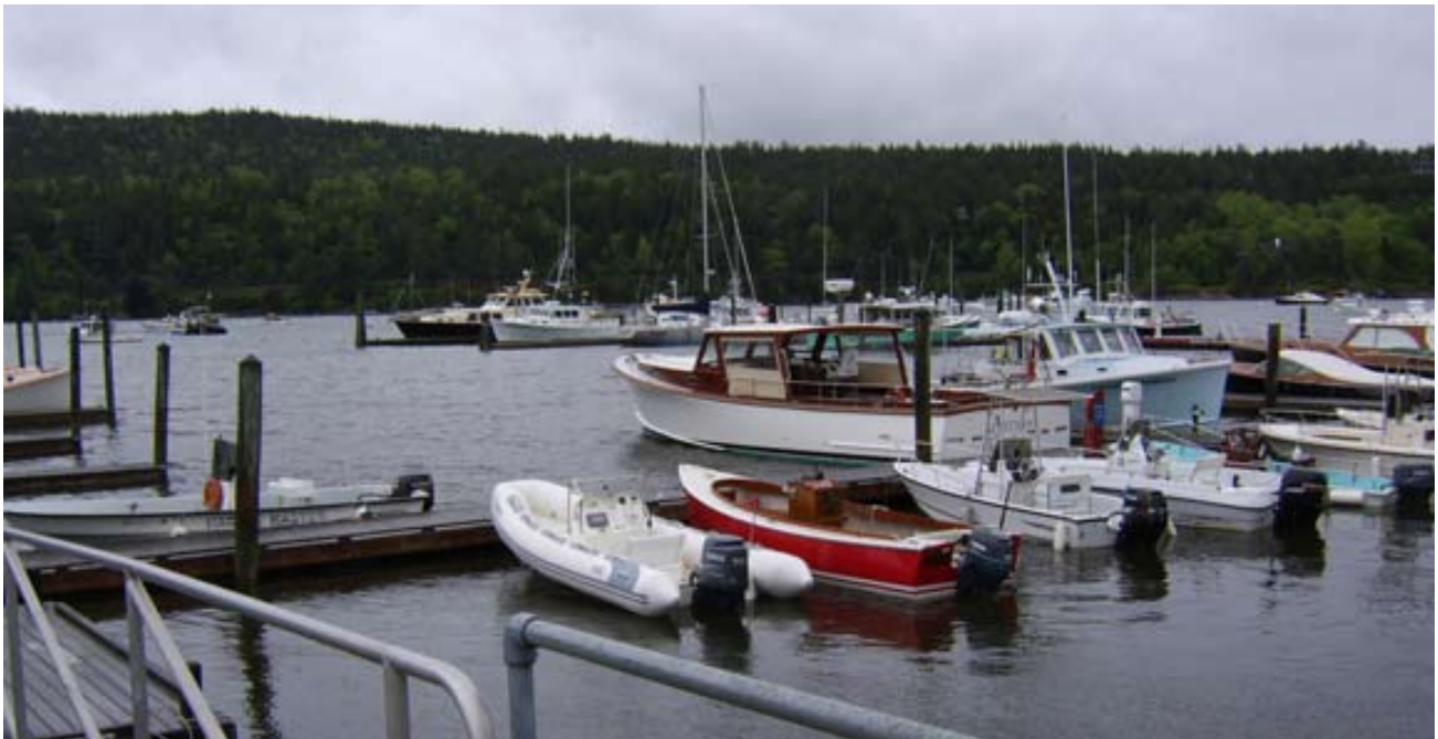
Boats tied up at the Northeast Harbor marina.

In April, 2011, the Committee made a series of recommendations to the Town of Mount Desert’s Board of Selectmen, which included the recommendation that the Town engage outside experts in revitalization “best practices.” The Town’s engagement with ULI Boston to organize a TAP grew from that recommendation. The TAP panel hopes that this report and its recommendations can be of use to the Revitalization Committee, the Town, and residents as they continue to strengthen partnerships and the community through their efforts.