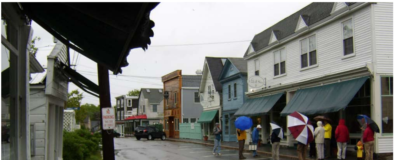
A view south down Main Street.

PEDESTRIAN ENVIRONMENT. Despite its good bones, Main Street does not have nearly as functional nor amenable a pedestrian environment as it could. At 36 inches, its sidewalks are narrow and, on the east side of the street, are made even narrower at each telephone pole. There are few trees and no outdoor structure—a pergola, arbor, small temporary shelter—along the street to provide shade in the summertime. Some storefronts do have awnings, but given the width of the sidewalk, such shaded spaces are not adequate to foster planned or impromptu gathering in small groups. Finally, there is really no place outside where one could sit.