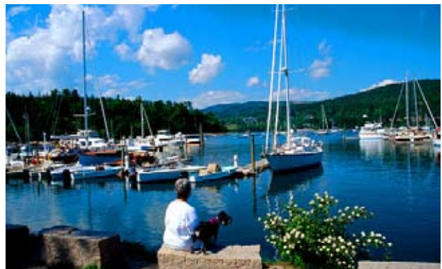
The off island parking lot's "front yard."

This site could potentially accommodate 15 to 25 units. One design concept would place units and resident parking on a deck above at-grade outer-island parking. Another design concept would place units above project parking with all or some of the outer island parking relocated. The choice between the two would be based on cost, alternate site availability, design, and ability to renegotiate the existing lease. Development could take advantage of the site topography, highlighted by a steep bluff at the southern and western edges, to allow a cascading multi-level project with ample outdoor deck space for each unit while not unduly impacting views or creating an obtrusive presence.