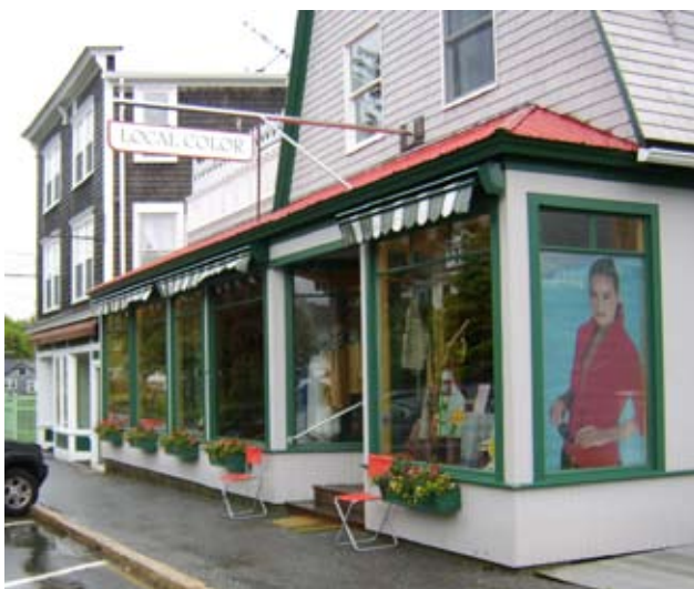
Local Color—a seasonal store on Main Street.

BUSINESS MIX. The table to the right shows the specific breakdown of business by category in Northeast Harbor's commercial district.