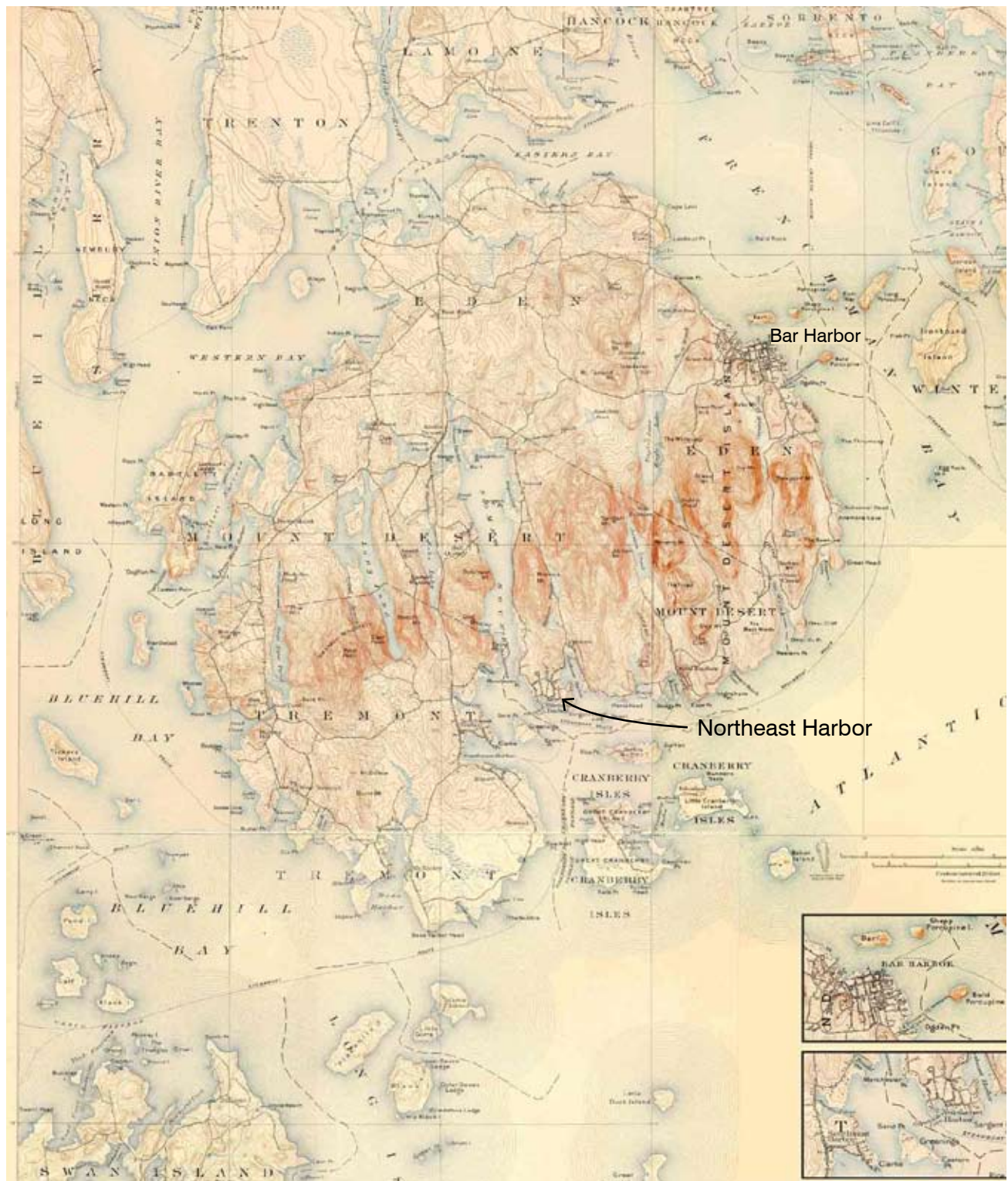
Figure 1: Mount Desert Island, topographical map, 1904