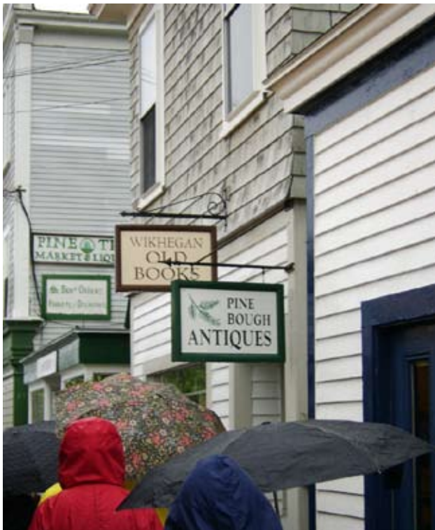
A coffee shop would be an excellent addition to shops that cater to summer residents and tourists.

Buy Local Initiative. A program that would increase and reward loyalty to commercial businesses in the village could be explored. This might provide some level of discount for an annual or seasonal purchase of “Village Dollars” redeemable at participating businesses. The potential for success of such a program would, in large measure, depend upon the appeal of the goods and services offered by the participating businesses.