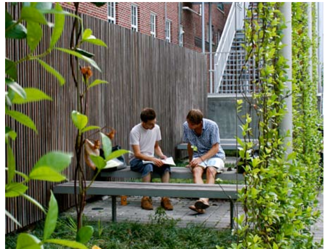
This small pocket park at Tulane University is incredibly simple: benches, pavers and ground cover, and a vegetated trellis to provide some shade.

Village Square Park on Main Street. A small vest pocket park on Main Street, activated with casual café seating and perhaps with limited coffee or other beverage service could create a signature focal point and attraction for the street. The panel feels the parking lot to the south of the maritime Museum could be a good location for such a park.