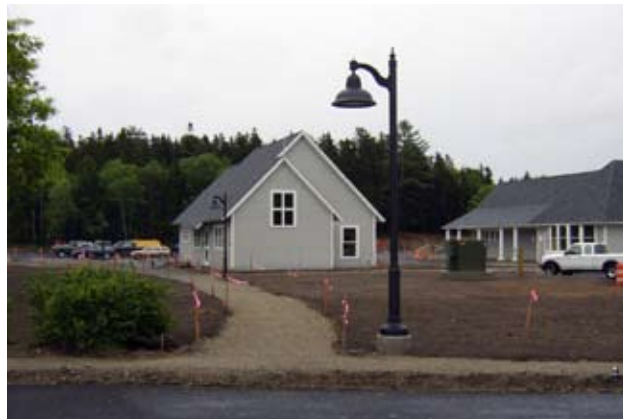
New Harbormaster's office and visitor center at the renovated marina.

PARKING. There appears to be ample Town-owned parking at the marina green and marina serving those attractions as well as in a large Town-owned lot (approximately 300 by 175 feet)- to the west of the marina green—which provides parking for the Town Offices as well spaces for residents who live off island, under a recently renewed ten-year lease.