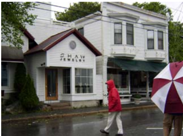
Many of Main Street's structures have historic character and are worth preserving and enhancing.

Facade Improvements. Building on the idea of enhancing historic assets, the Town could develop programs that support facade improvements of historically significant buildings. A Revolving Loan Fund could allow building owners to make improvements at low interest rates.