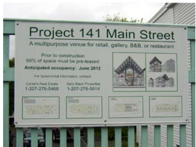
A proposed redevelopment concept for the now vacant site at 141 Main Street. The project has been unable to move forward.