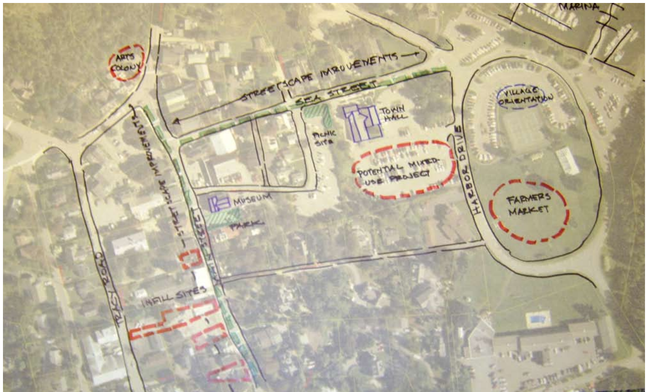
Figure 2: Concept Plan

Dredge Harbor, Expand Use for Charter & Tour Boat. The Town could consider dredging to allow for more charter and tour boats which could bring more visitors to the village.