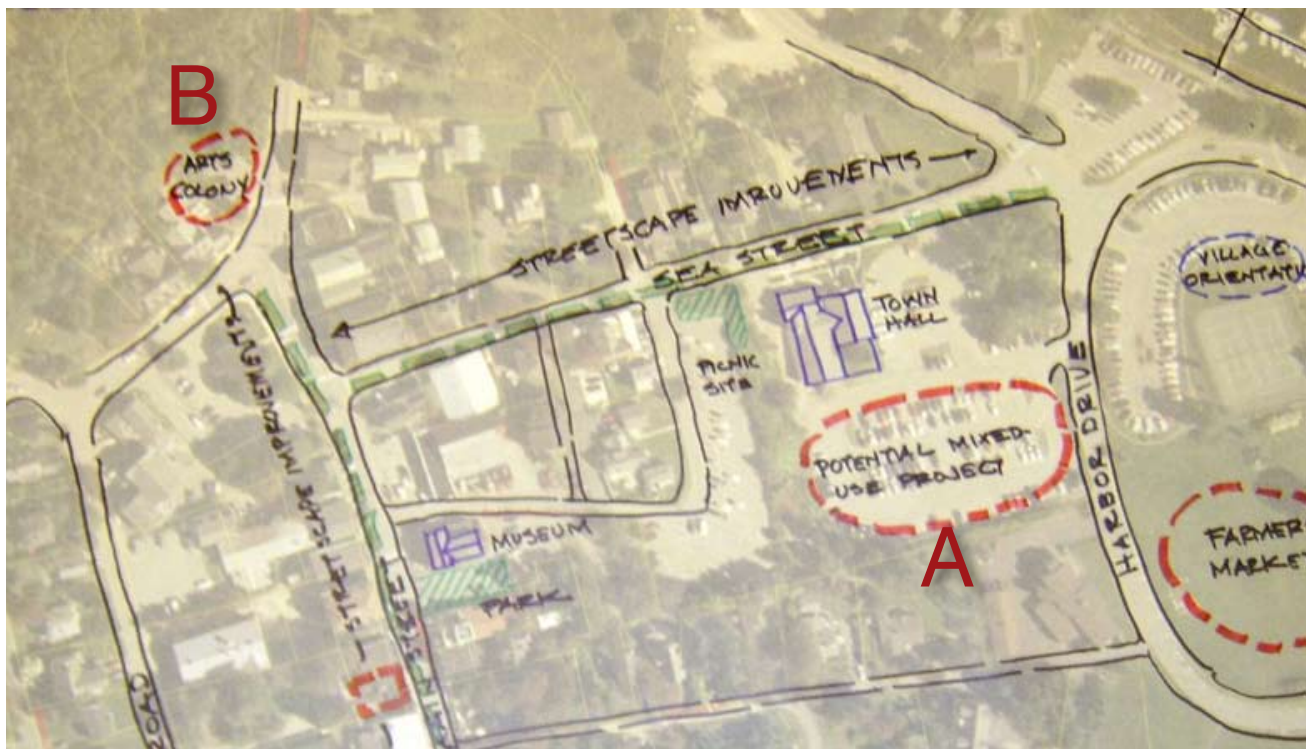
Figure 3: Sites for New Development

A. Off-Island Parking Lot: Market Rate or Affordable Housing