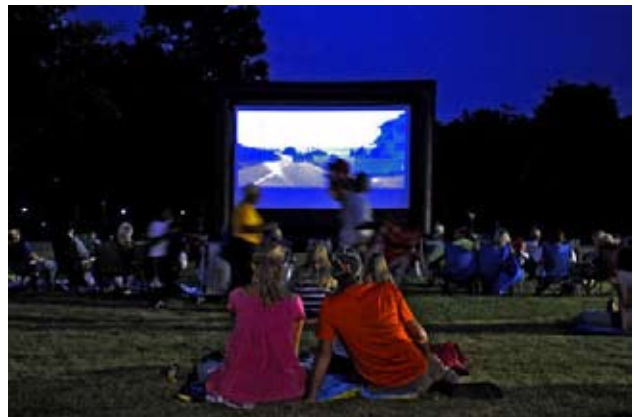
An outdoor movie night in a Myrtle Beach park.