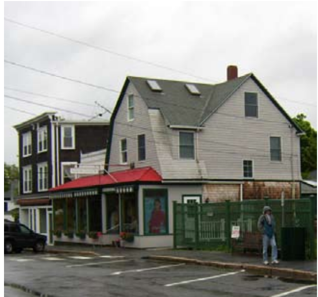
Shops on Main Street adjacent to one of three vacant lots on the commercial street created by fire.

However, in the last thirty years these dynamics have changed. Specifically, increased demand for housing for the affluent seasonal market has led to a shift in focus from waterfront and other more traditional seasonal locations to a broader array of more modest, historically year-round homes throughout the town and especially in and around the village center. As these properties turn over, seasonal buyers are reportedly