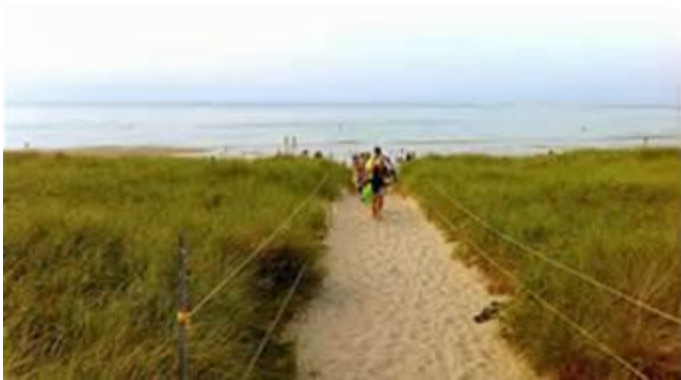
Crane Beach - Ipswich