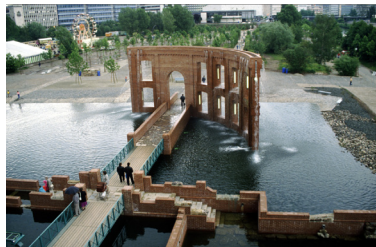
City Park on the River Port Island, Saarbrücken