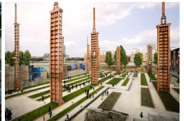
Parco Dora, Turin