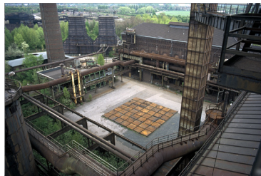
Duisburg-Nord Landscape Park, Piazza Metallica