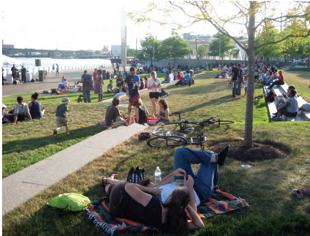
The Yards Park on the Anacostia River blends active and passive activities with the heritage of an industrial waterfront.

Cities and towns should link new investment to its benefits for natural ecosystems and use it to prioritize development. This strategy applies at all scales—from a simple bench under a tree, to an open window in the office, to a countywide reduction in greenhouse gases. A broad and consistent effort contributes to a unique feel of a community.