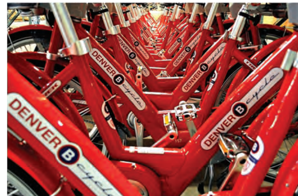
Successful bike-share programs have become increasingly popular, providing urban dwellers and visitors with an alternative, healthy option in transportation.