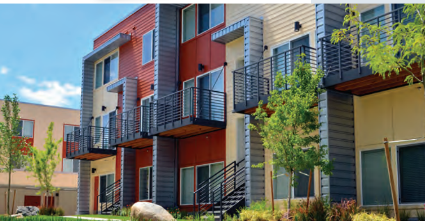
Mariposa is an example of how champions such as the housing authority and the residents combined their efforts to achieve a positive outcome in terms of health. Together, they focused on building the Mariposa brand, encouraging grassroots actions, and communicating the benefits of an improved community.

Monitoring has shown positive trends in many of the indicators of a healthy community, such as the total crime rate, which has dropped from 246 crimes per 1,000 people in 2005, to 157 in 2011, or the average transit commute time, which has dropped from 24 minutes in 2010 to 20 minutes in 2012. In the first phase of development, Tapiz, a 100-unit multifamily building, several elements were incorporated to improve health of residents, such as an eight-story building-integrated mural that celebrates the cultural diversity and history of the neighborhood and the community gardens available to residents to grow their own fresh foods in partnership with Denver Urban Gardens.