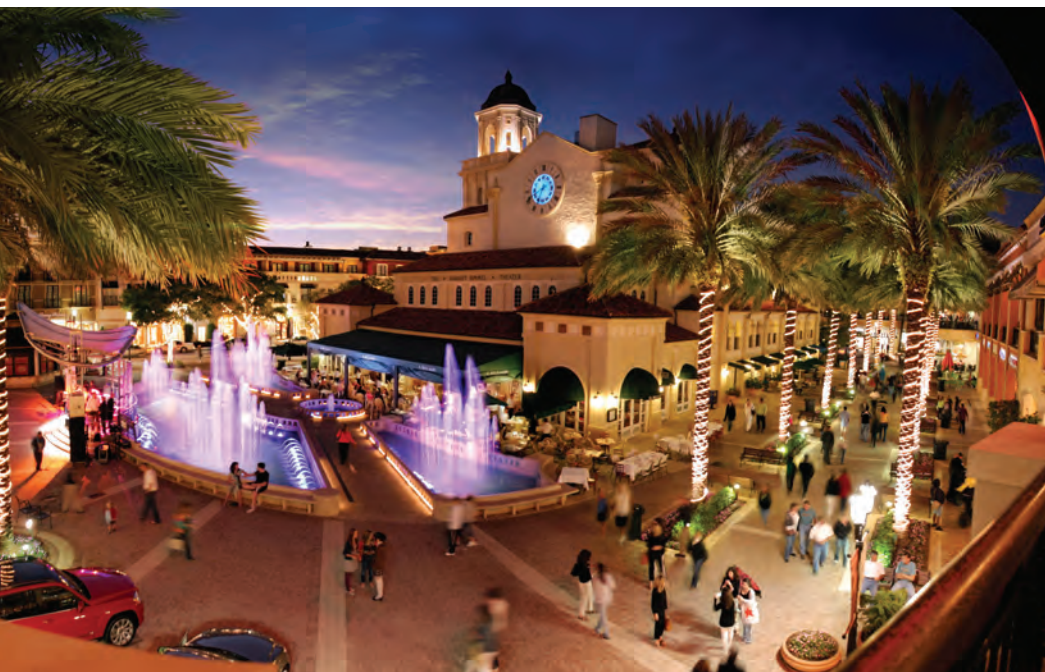
CityPlace in West Palm Beach, Florida, combines higher-density residential space with main-street retailing and active public gathering places.

One challenge to “mixing it up” is that the real estate industry tends toward simplicity: developers often prefer buildings to contain either a single use or at minimum a strong leading use. Some lenders are hesitant to finance unproven concepts, especially vertical mixed use, and municipalities have not always had success trying to regulate the mix of uses—for instance, requiring ground-floor retail where the market may not support it. How can towns and cities overcome these challenges?