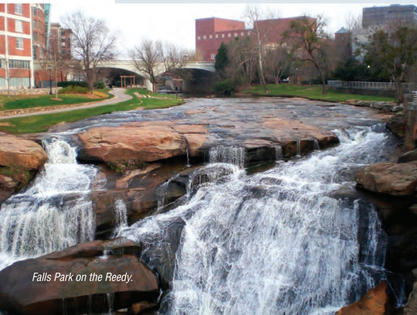
Falls Park on the Reedy.

Greenville leaders often emphasize that success can be found in the special attributes of a community. Although that particular attribute is different in each city—in Greenville’s case, it was a 60-foot waterfall located right off Main Street—capitalizing on those existing assets is crucial for economic development.