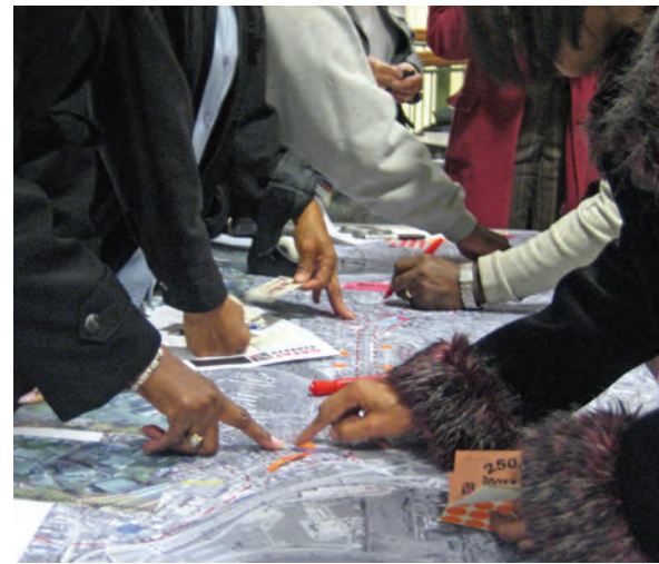
Incorporating health into a community's public planning process lays the groundwork for a community for generations to come.

The development community, local government, or both in cooperation can develop HIAs. Doctors advise their patients on how they can stay healthy, and in many ways, an HIA provides the same advice to communities. This guidance helps communities make informed choices about improving public health through community design.