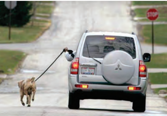
Physical activity has almost been completely designed out of everyday life.

Urban design can be employed to create an active community.