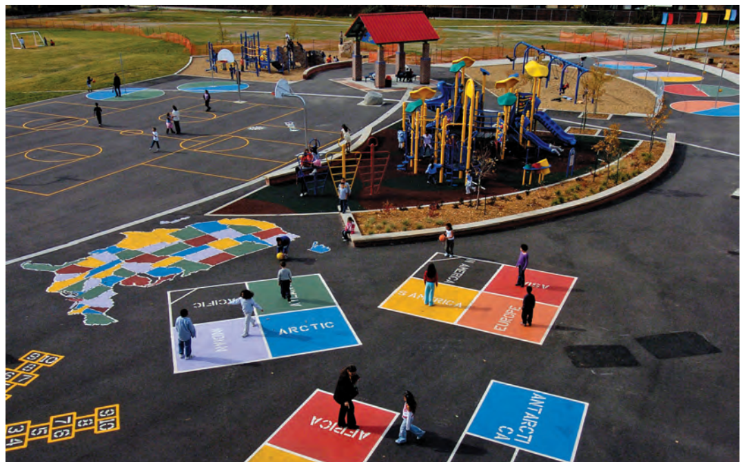
Adding colors to playgrounds encourages activity.

Access to safe neighborhood play spaces for children is associated with higher rates of physical activity and lower rates of time spent watching television and