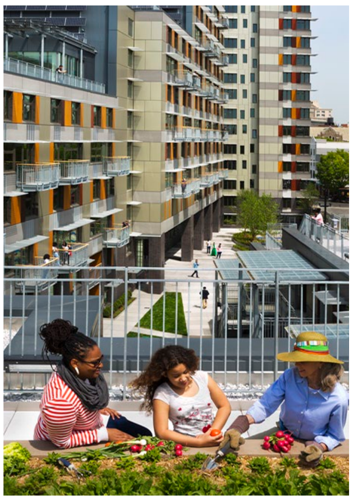
Via Verde, Bronx, NY