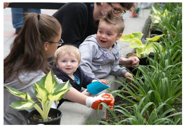
Tapestry Community Planting Day, New York, NY